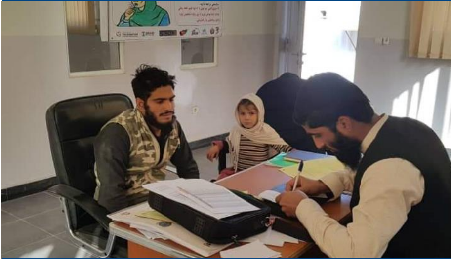
Screening of undocumented Afghans for Presumptive TB cases at Turkham Zero Point under multi-country grant TB project supported by Global fund/UNDP.