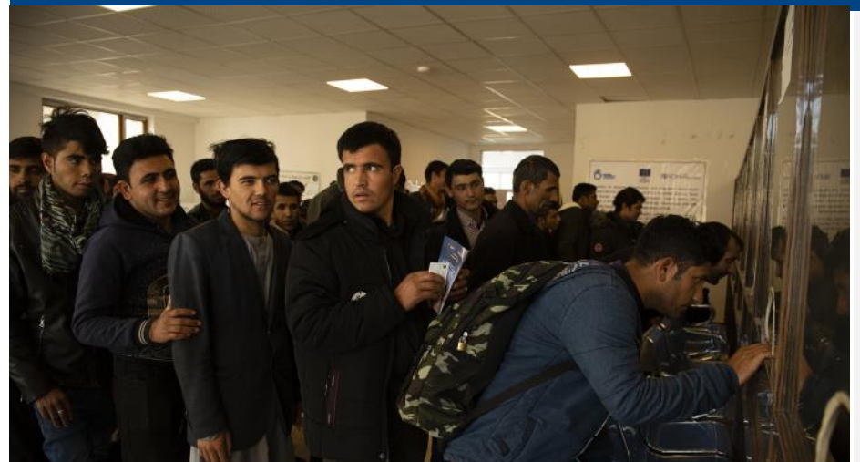
Returning Afghans registering in the Afghan Returnee Information System with the Directorate for Refugees and Repatriation at the Milak border in Nimroz.

WEEKLY SITUATION REPORT 01—07 DECEMBER 2019