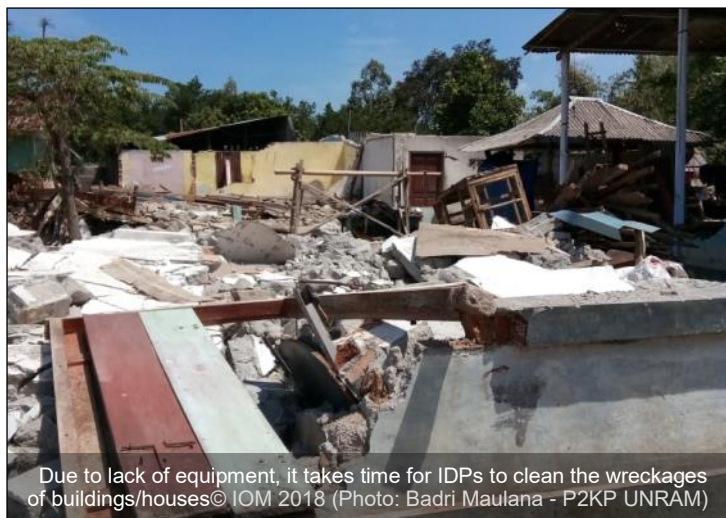
Due to lack of equipment, it takes time for IDPs to clean the wreckages of buildings/houses

In general, several NFIs such as blanket, cooking fuel, cloths, cooking utensils, carpentry equipments and mattress/mats have been received by IDPs. Aforementioned aids came from various service providers that can be classified as follows: government (primary provider in 32% or 1,634 camps), private sectors (primary provider in 24% or 1,235 camps), local,