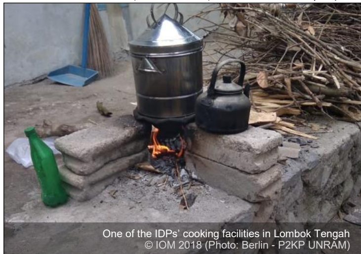
One of the IDPs' cooking facilities in Lombok Tengah

During data collection period, there were camps without communal cooking facilities to be access and used to cook food by IDPs, unlike during emergency phase. This condition led to a situation where IDPs have to provide their own meals independently. However, not all of IDP camps have access to cooking facilities to fulfil their needs. Out of 2,700 recorded camps, there are people in 861 camps (inhabitant by 145,922 IDPs) who have no direct access to cooking facilities . Apart from this situation, most of IDPs purchase their groceries with their own money and merely IDPs in 51 camps (total