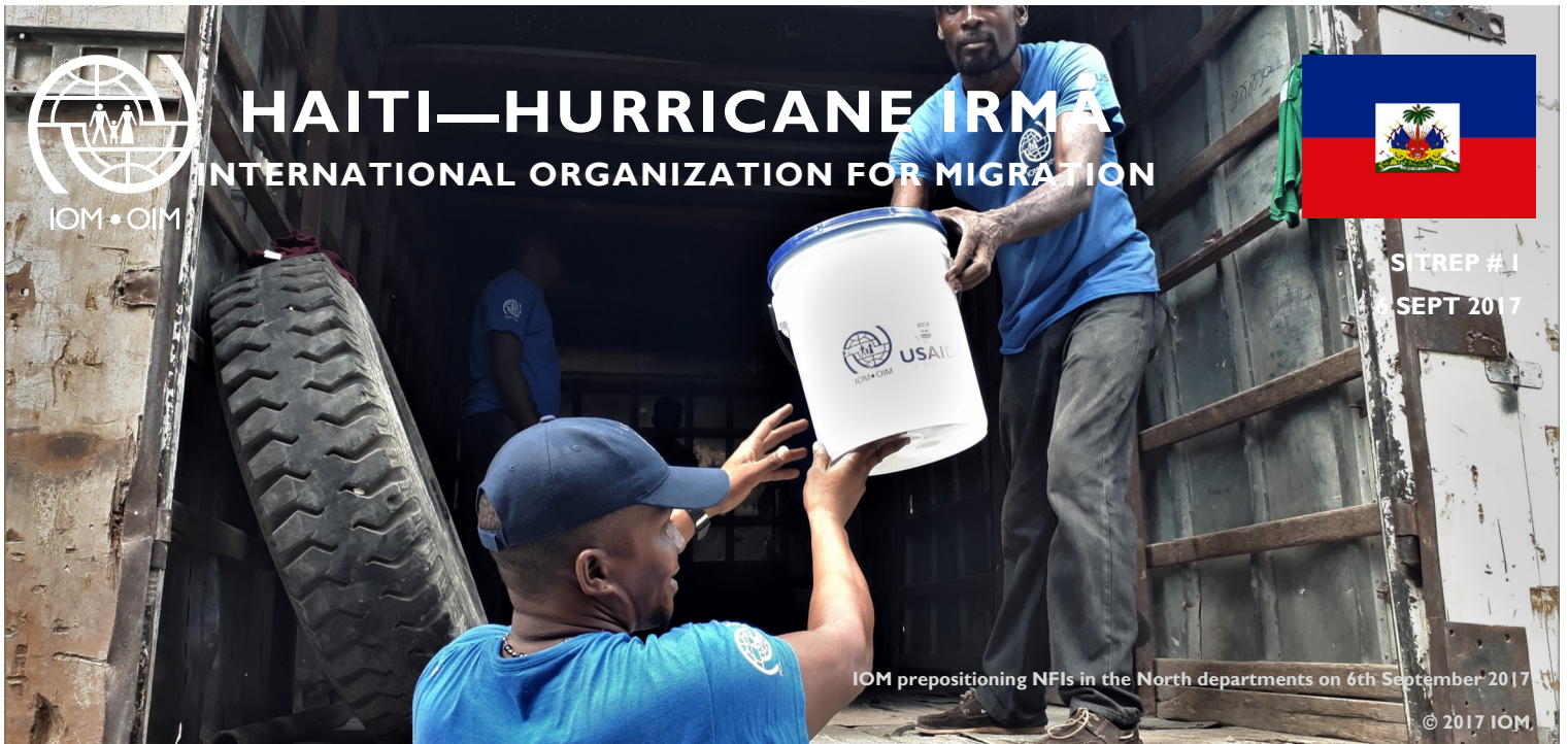
IOM prepositioning NFIs in the North departments on 6th September 2017