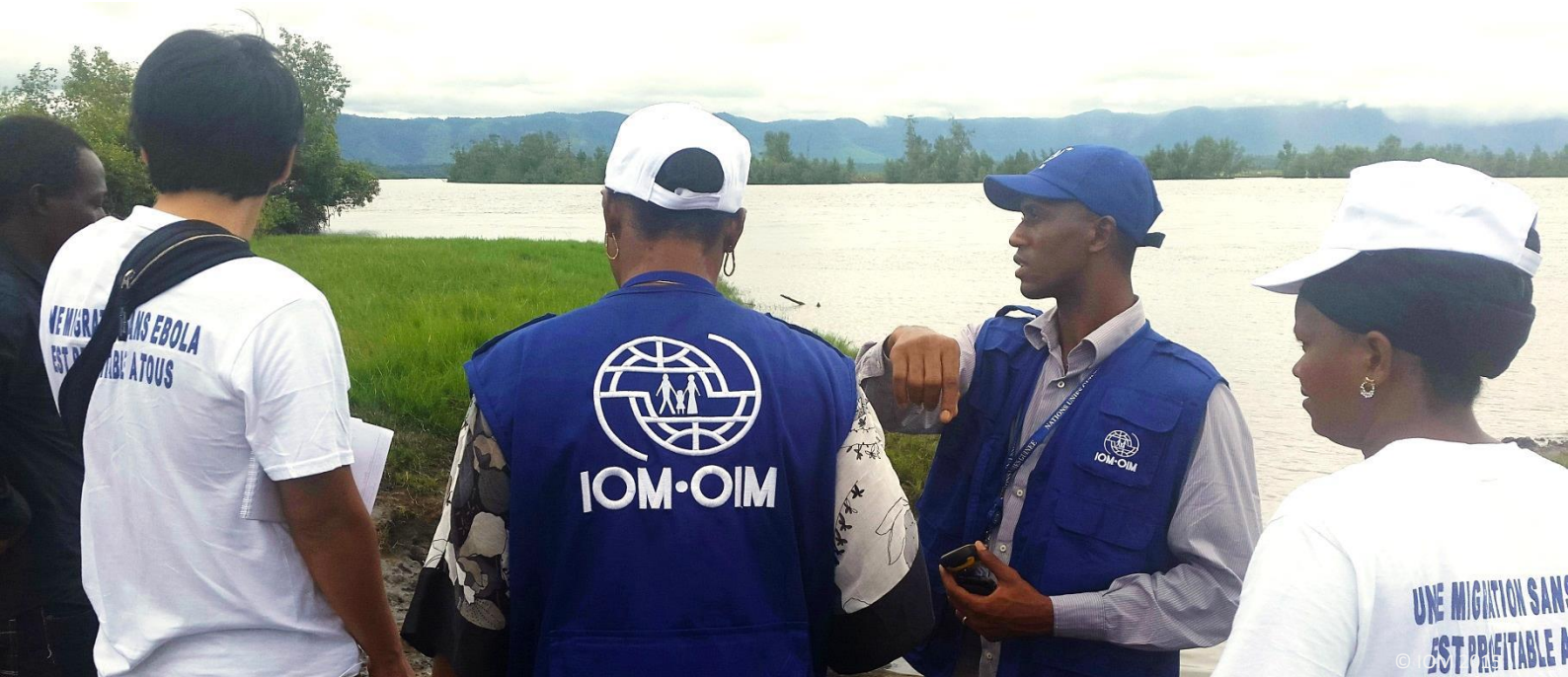
Visit of the Wharf in Tanene, Dubreka Prefecture