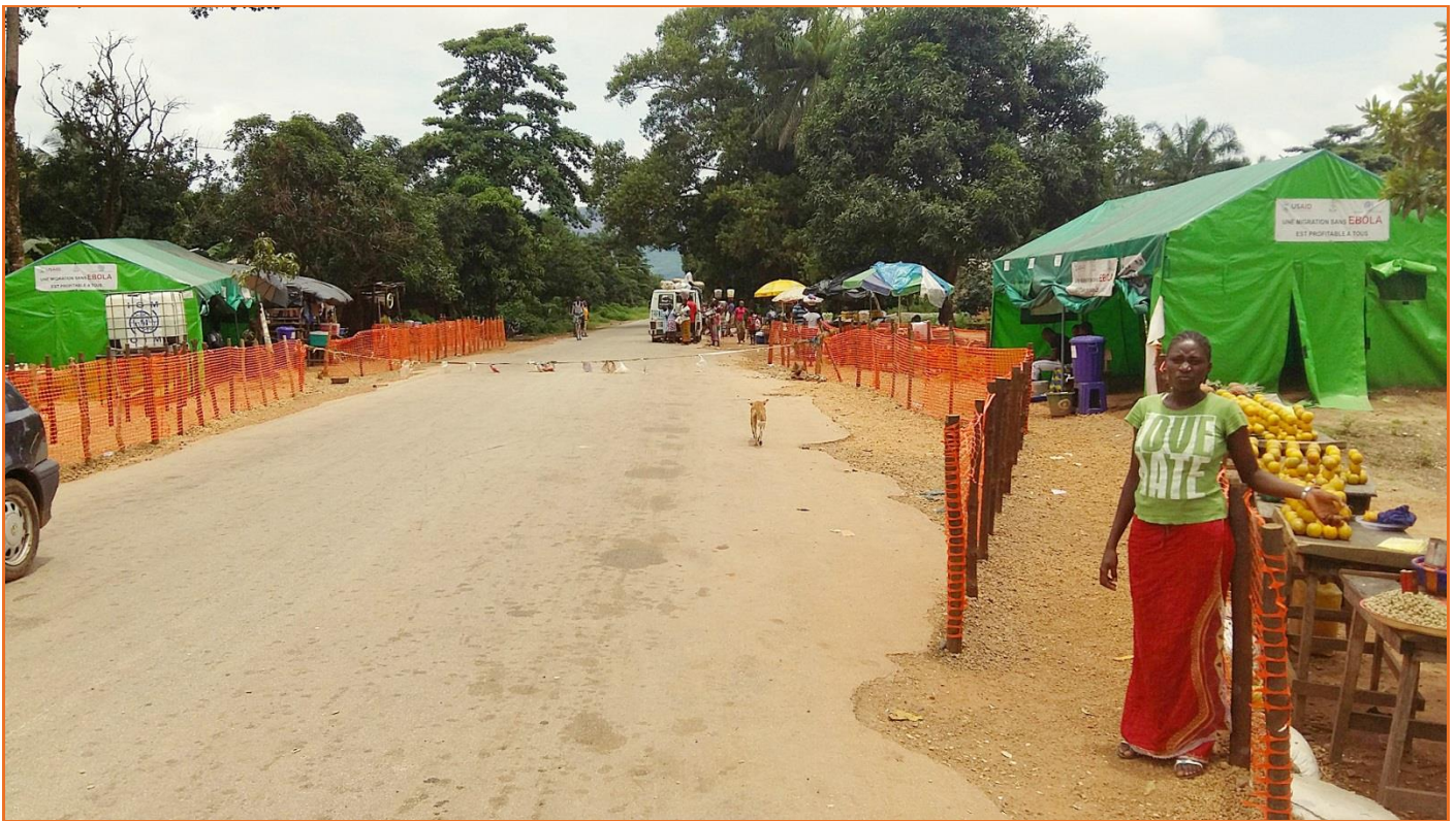
One of IOM's health control check points, installed on the Coyah-Forecariah main road, KM66