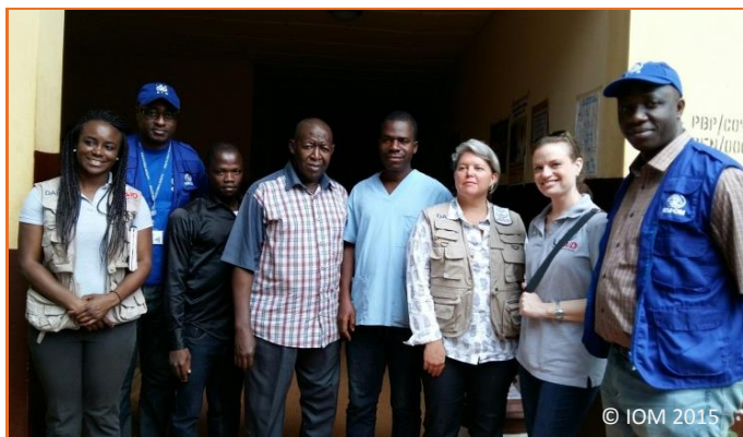
IOM/OFDA teams with three health personnel who survived the EVD-COYAH

those relating to the PEOCs as well as meet with other humanitarian partners within the municipality. A working session followed with the coordinator of COYAH PEOC as well as other partners. The coordinator expressed his satisfaction of the services rendered by IOM to Coyah Prefecture in particular and to Guinea in general since the outbreak of the EVD.