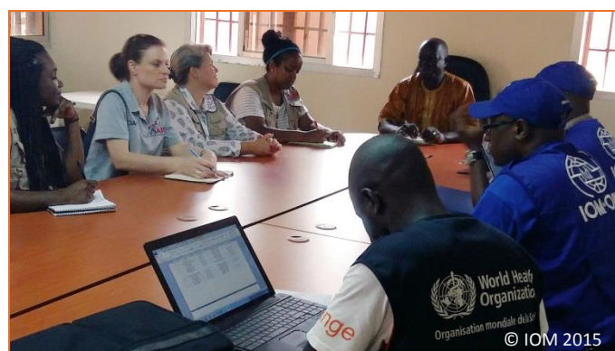
Working session with the coordinator of COYAH

IOM and Office for Foreign Disaster Assistance (OFDA) organised a field visit to Coyah on August 26 2015. The aim of the visit was for the new OFDA team leader to have an appraisal of IOM's activities and in particular