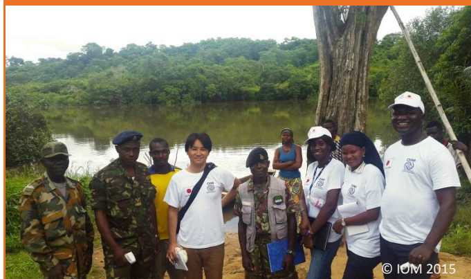
With border Security officers at the Sierra Leone end