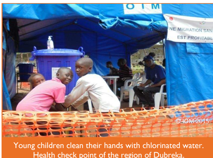
Young children clean their hands with chlorinated water. Health check point of the region of Dubreka.

In order to ensure the follow up of those sensitization campaigns, IOM staff regularly makes visits to these sites to make sure that communities are observing good hygiene practices and visitors protocols.