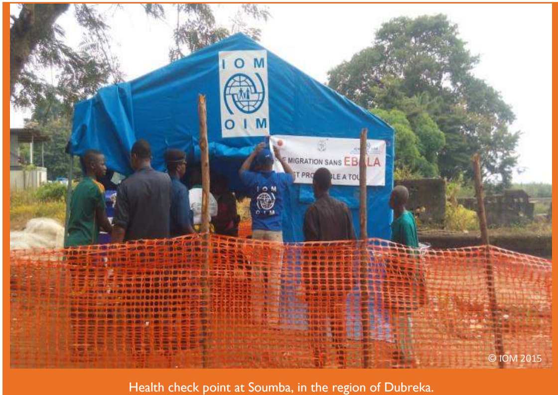
Health check point at Soumba, in the region of Dubreka.