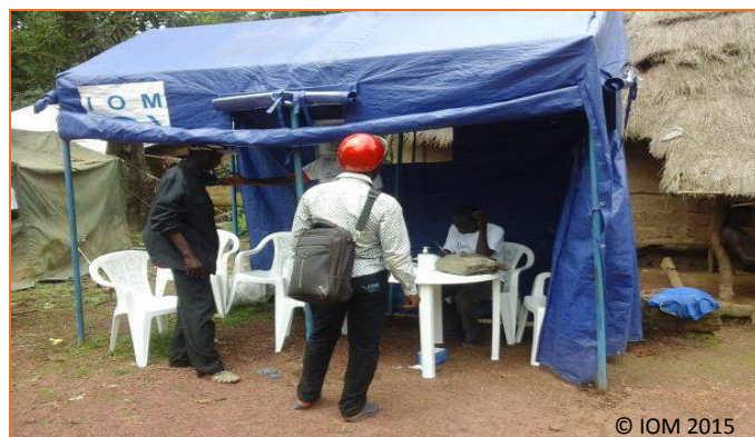
New health control post at Kalounka, sub-prefecture of Dabiss, border zone Guinea/Guinea-Bissau.

cases, they collect demographic data on travellers that are used to track persons that may have been in contact with any confirmed case. To date, 20,055 travelers have been controlled and sensitized at the health control check point of Pamelap, Laya and Dakhagbe.