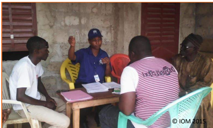
Debriefing with social mobilizers of Laya.

IOM continues to strengthen health control check points along borders, at the country entrance points and border zones by providing logistics as well as human resource support. In the region of Forecariah, IOM conducts regular field visits to health check posts (PCS) of Pamelap, Dakhagbe and Laya, which are all entrance points to Sierra Leone. Even at this phase of the epidemic, there are still instances of people who do not want to comply with the protocols at the checkpoint. IOM works with social mobilizers, local authorities, and community representatives to help them understand the importance of health control.