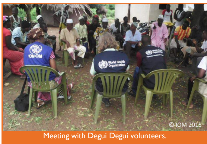
Meeting with Degui Degui volunteers.

IOM and its partners, WHO, UNICEF and AGIL met on September 18 with community volunteers of Degui Degui, Yangban and Benty to sensitize them on community based surveillance and health control at the wharf of Benty, which is a village located close to the Guinea-Sierra Leone border.