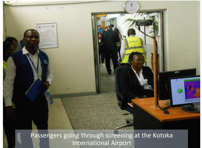
Passengers going through screening at the Kotoka International Airport

hygiene practices. During the current field assessment IOM has conducted community mapping, identifying at risk communities, and has met with key officials at the regional, districts and sub district levels. IOM met with the Tema Metropolitan Assembly Ebola Committee on 3 June 2015 to begin mapping and establishing partnership for community mobilization activities around Tema Port. The project's objective is to engage targeted communities through the use of local radio stations, IEC materials and forums aimed at behaviour change and better understanding on EVD infection, prevention and control.