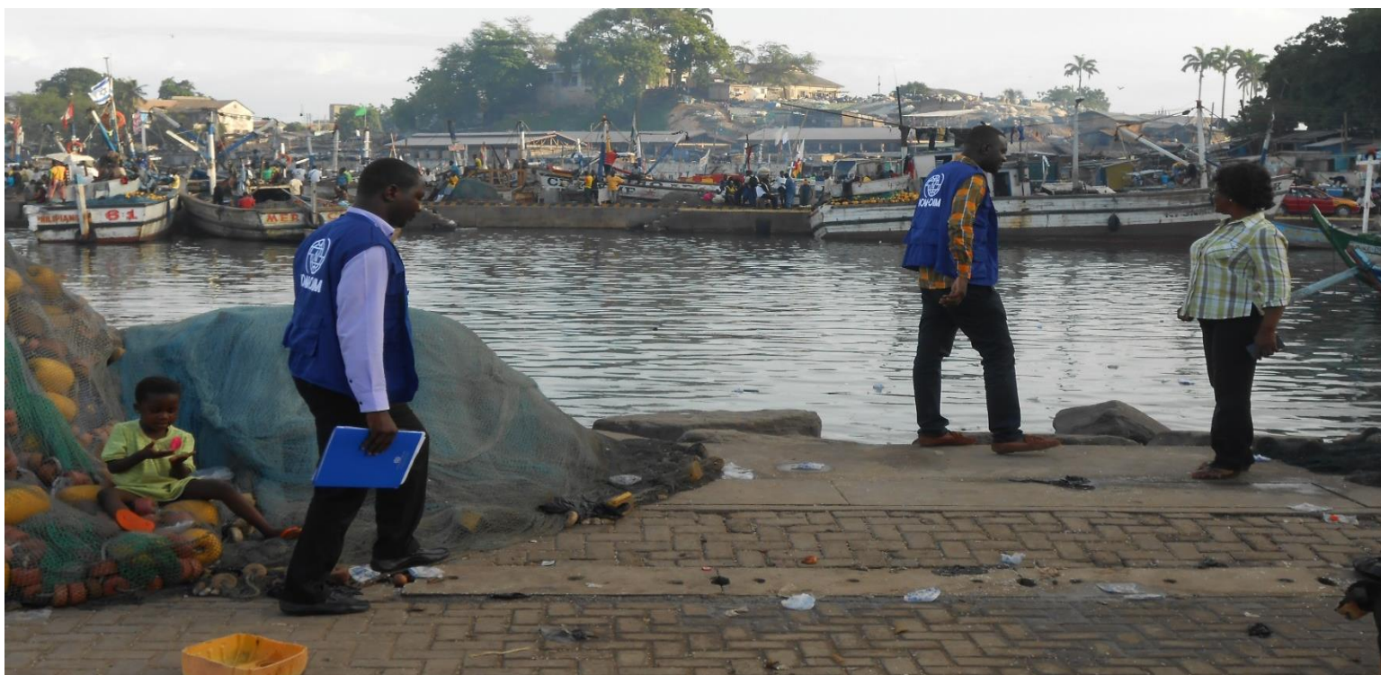
IOM Ghana EVD team at the fishing harbour at Takoradi