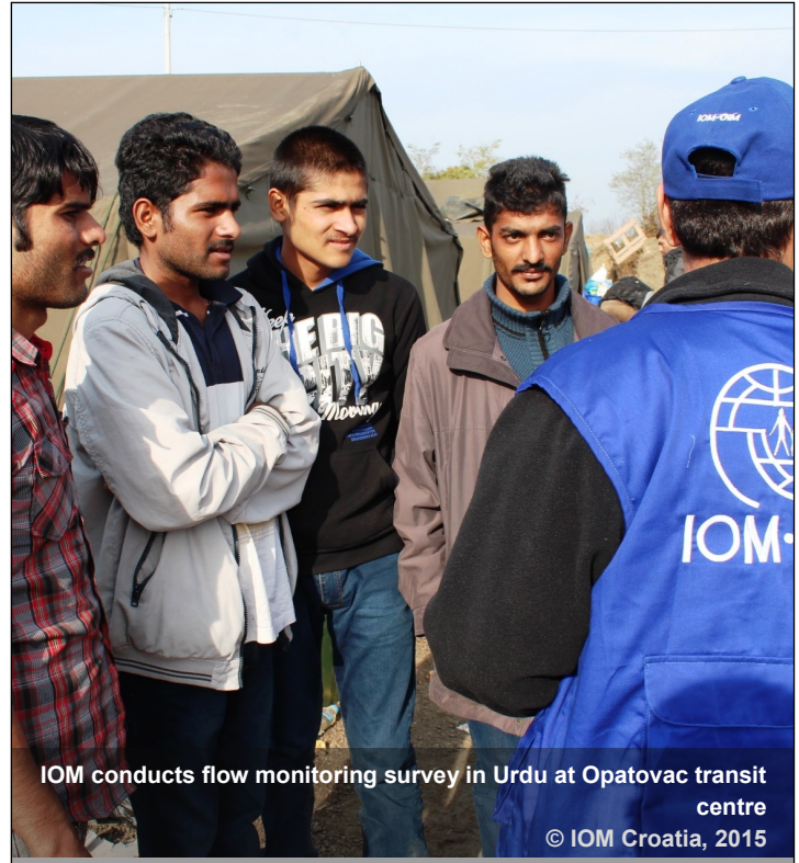
IOM conducts flow monitoring survey in Urdu at Opatovac transit centre

Opatovac transit centre, including family tracing and reunification (led by the Croatian Red Cross) and migrant medical aid (provided by the Ministry of Health).