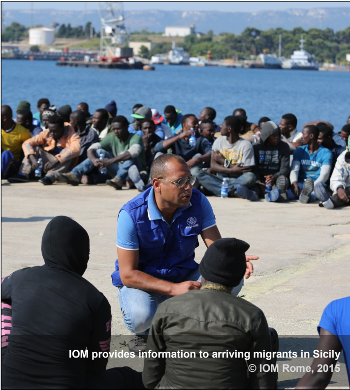
IOM provides information to arriving migrants in Sicily

IOM has two anti-trafficking teams working in Sicily and Apulia with the specific aim of enhancing detention and identification of victims of trafficking and exploitation . IOM has contributed in the identification and referral to the relevant authorities of vulnerable migrants, including unaccompanied minors who were mistakenly identified as adults during the disembarkation procedure.