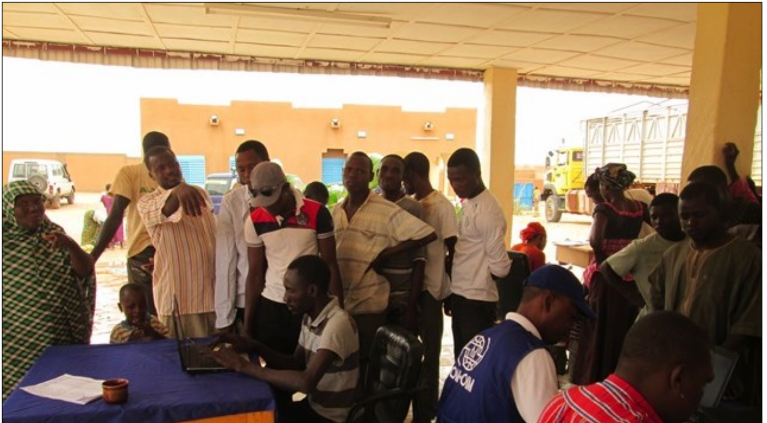
Registration at the Agadez transit and assistance centre, Niger

Reintegration and psychosocial activities continue in Zinder as part of IOM's on going counter-trafficking efforts. Women and men returning from Algeria are being supported by IOM and other partners to facilitate socio-economic reintegration. Moreover, IOM is working in close coordination with the Ministry of Justice to set up the first state-run shelter for trafficking victims in Niger. A facility in Zinder has been identified and, following some rehabilitation works, the existing facility could potentially be used as a shelter.