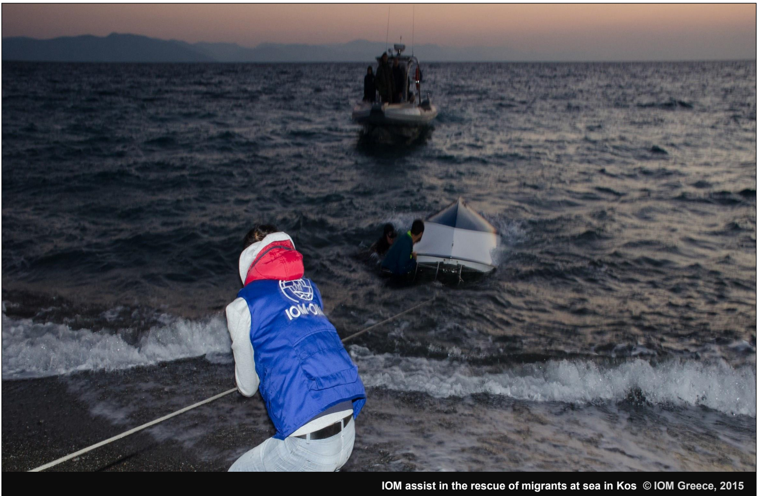
IOM assist in the rescue of migrants at sea in Kos

On Kos Island, IOM officers continue to provide vital support in the area as no official facilities for receiving large groups of migrants have been set up. Last week, IOM assisted in rescuing migrants who were trapped under a boat after it capsized. All migrants on board were successfully rescued.