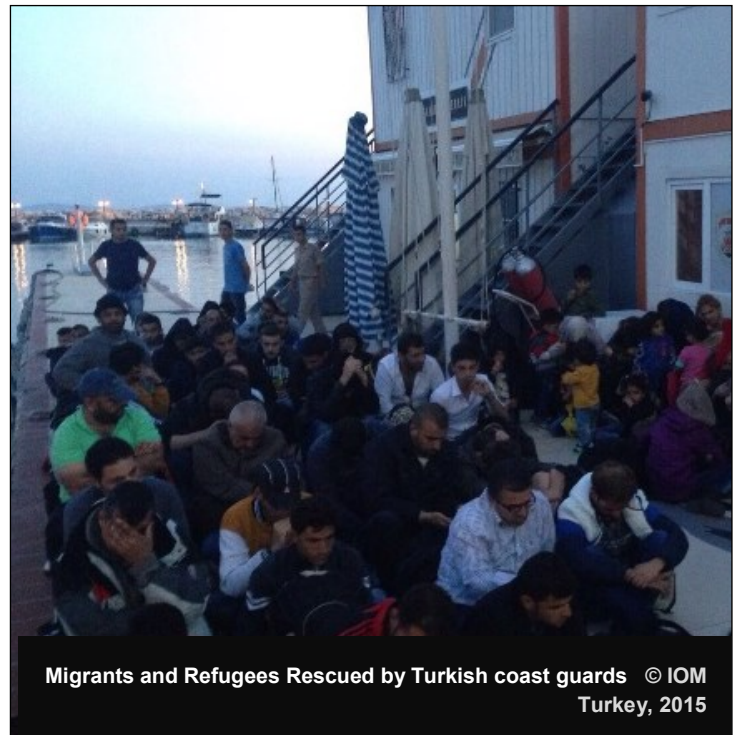
Migrants and Refugees Rescued by Turkish coast guards

In addition, IOM continues to further augment the capacity of the coast guard through the provision of key supplies such as rescue platforms. This support will be further complemented with the provision of packages for migrants rescued at sea. These packages will include blankets, hygiene items and food.