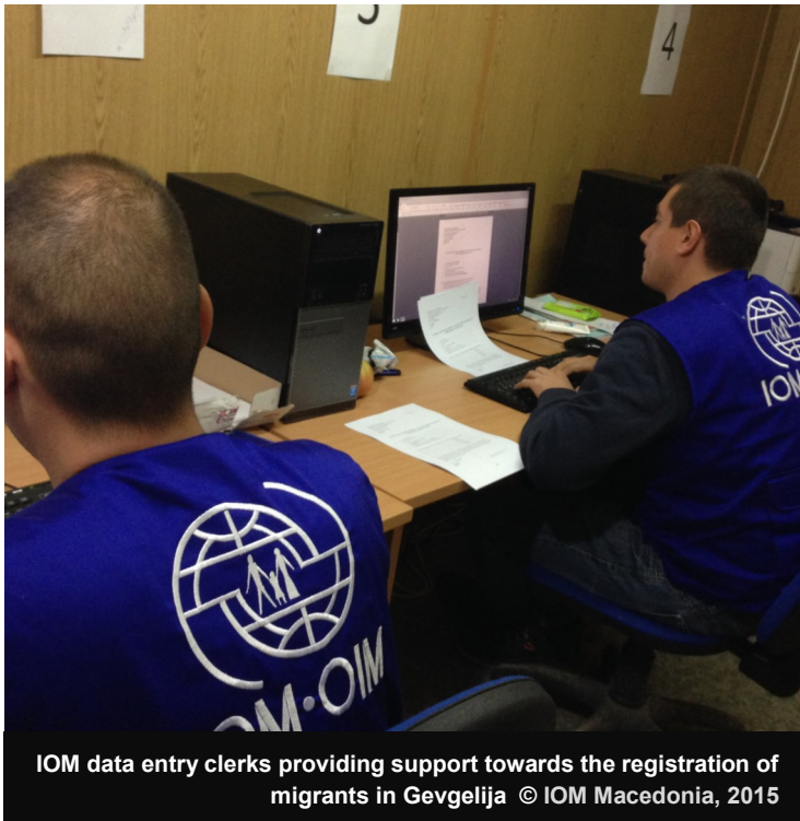
IOM data entry clerks providing support towards the registration of migrants in Gevgelija

Two vehicles have been provided to the Ministry of Labour and Social Policy to facilitate the transport of vulnerable migrants and to facilitate humanitarian operations in the border areas.