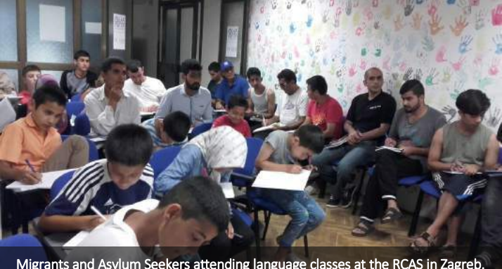
Migrants and Asylum Seekers attending language classes at the RCAS in Zagreb.

During the reporting period, IOM purchased 130 bathroom refurbishment sets (shower accessories and toilet sets including bowls, seats and flushers), 45 chairs, and two tables for the rooms at the RCAS where classes are held.