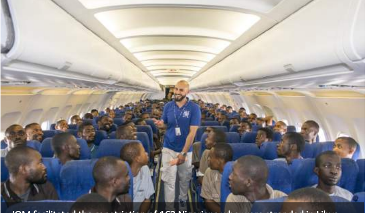
IOM facilitated the repatriation of 162 Nigerians who were stranded in Libya.

The repatriated migrants were received by IOM in Nigeria at the Murtala Muhammed International Airport and were provided with cash grants upon arrival. Of the group, 20 will be provided with reintegration support.