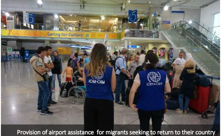
of origin.

During the reporting period, IOM's team of cultural mediators provided information services to 131 newly arrived migrants at the First Reception Centres in Lesvos and Samos islands, and registered 156 migrants in Lesvos. Additionally, the IOM teams provided medical assistance and psychosocial sessions to 588 beneficiaries.