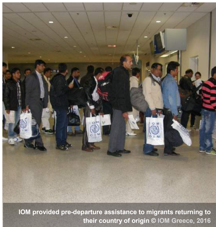
IOM provided pre-departure assistance to migrants returning to their country of origin