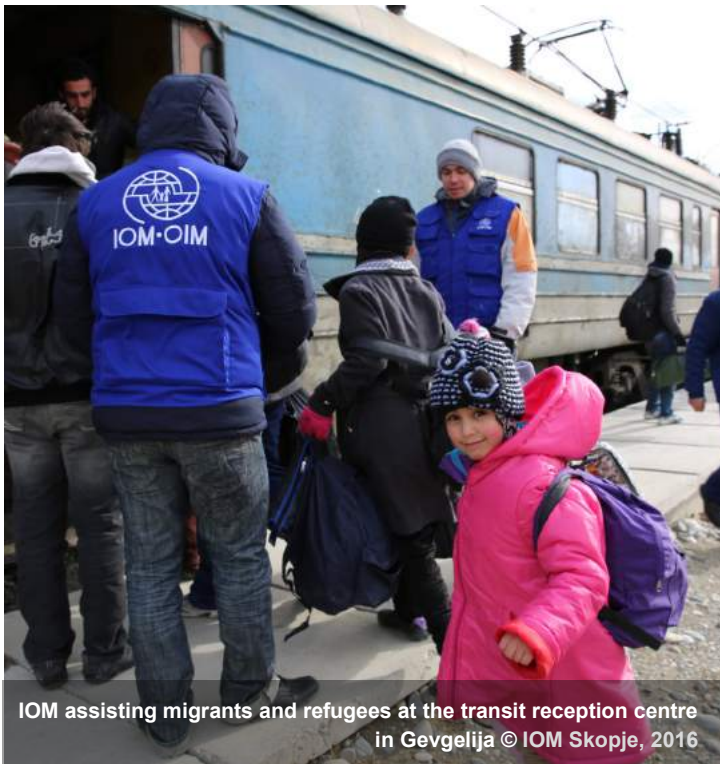
IOM assisting migrants and refugees at the transit reception centre in Gevgelija

From 19 June 2015 to 24 January 2016, IOM's registration teams, together with the Border Police and the NGO Young Lawyers Association have registered a total of 428,460 migrants and refugees. 53 per cent (226,313) male, 17 per cent (74,724) female, 26 per cent (110,199) children, and 4 per cent (18,224) unaccompanied children.