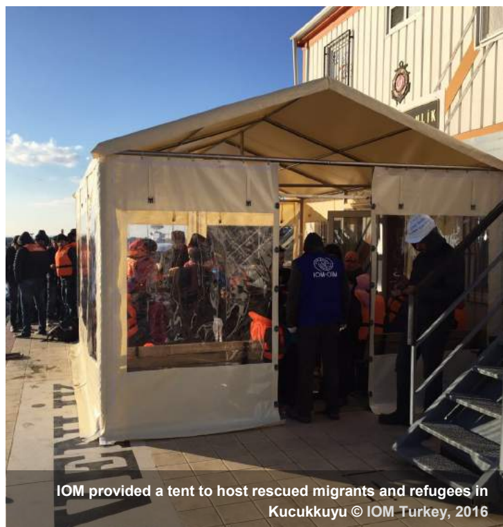
IOM provided a tent to host rescued migrants and refugees in Kucukkuyu

border of Kucukkuyu, IOM also provided one tarpaulin tent where refugees and migrants will be hosted to avoid the harsh winter conditions. The tent will accommodate up to 25 persons. IOM will be providing five additional tarpaulin tents for reception areas in Dikili, Aykalik, Cesme, Didim, and Bodrum.