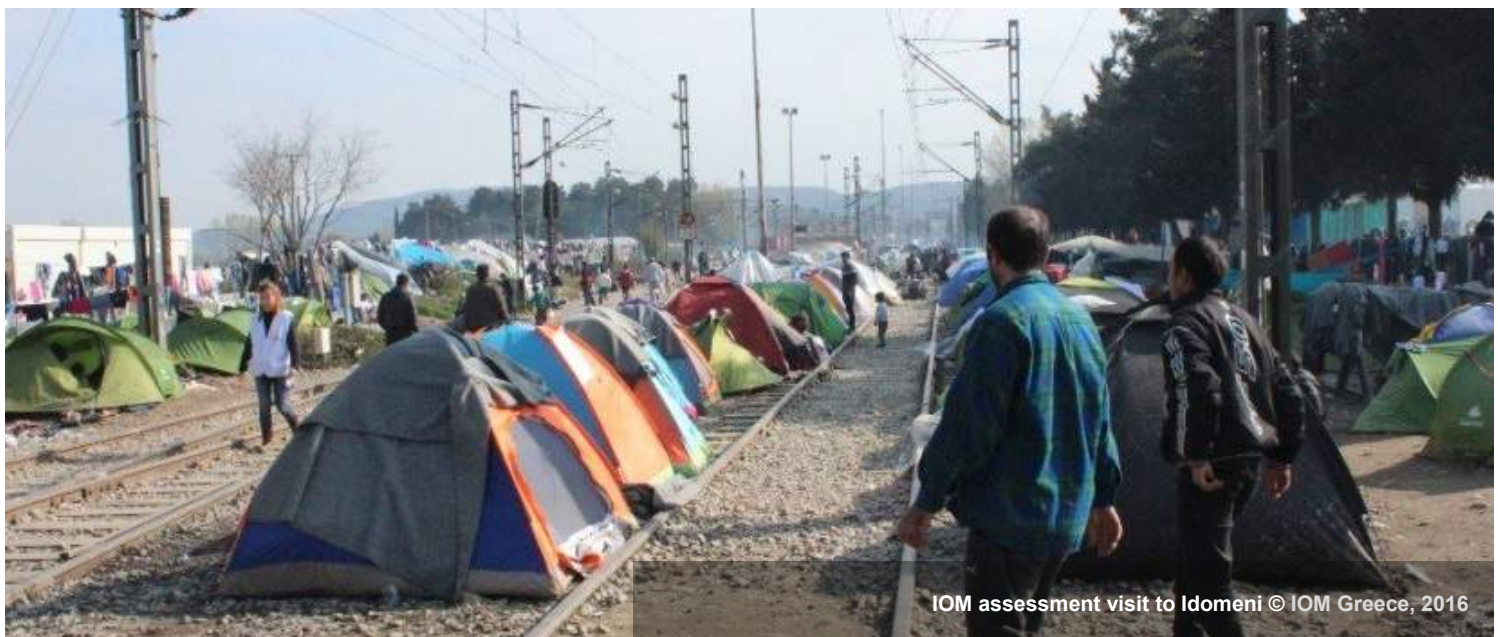
IOM assessment visit to Idomeni

In order to gather and disseminate information about the migrant and refugee populations moving through the Mediterranean, up the Western Balkan Route and through the Northern Route into Europe, in September 2015, the Displacement Tracking Matrix (DTM) team established a Flow Monitoring System (FMS). The FMS provides a weekly overview of migration flows in countries of first arrival and other countries along the route in Europe (including Turkey, Bulgaria, Greece, the Former Yugoslav Republic of Macedonia, Serbia, Hungary, Croatia, Slovenia, and Italy), and provides an analysis of trends across the affected region. The data on registered arrivals is collated by IOM