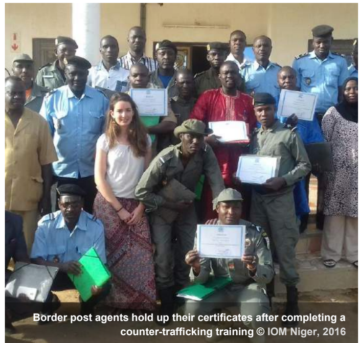
Border post agents hold up their certificates after completing a counter-trafficking training

From 15-16 March, IOM conducted a counter-trafficking training for 25 border post agents in Agadez. The training was organised by the National Agency Against Human Trafficking (NAHT) and IOM under the umbrella of IOM's continued support to the NAHT agency.