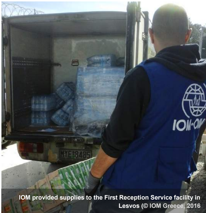
IOM provided supplies to the First Reception Service facility in Lesvos

in Lesvos, Evros, and Leros. The equipment delivered to the facilities help to run the day to day operations of the FRS while personnel help to provide direct assistance to rescued migrants and refugees.