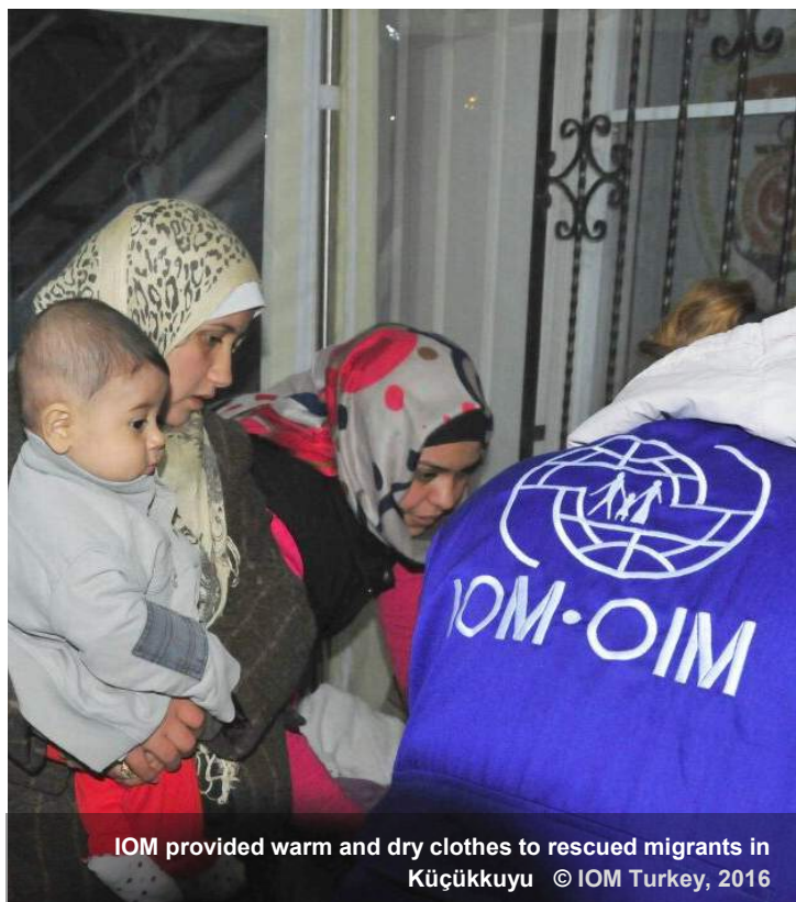
IOM provided warm and dry clothes to rescued migrants in Küçükkuyu

To support the government, IOM has provided personnel and equipment to the First Reception Service (FRS) facilities