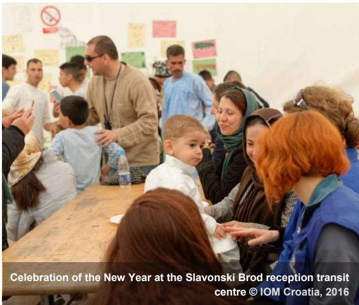
Celebration of the New Year at the Slavonski Brod reception transit centre

At the Slavonski Brod centre, migrants from Iraq and Afghanistan celebrated the New Year with the support of IOM and other humanitarian agencies. IOM promoted community work, provided crockery and decorations, and helped to develop the programme of the celebration.