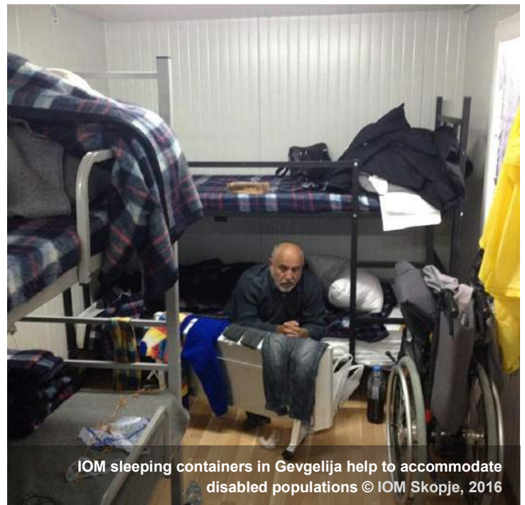
IOM sleeping containers in Gevgelija help to accommodate disabled populations

IOM has completed the installation of 26 sleeping containers at the transit reception centre in Gevgelija to meet the needs of migrants and refugees at this centre. The containers are fully equipped with beds, linens, pillows, and blankets.