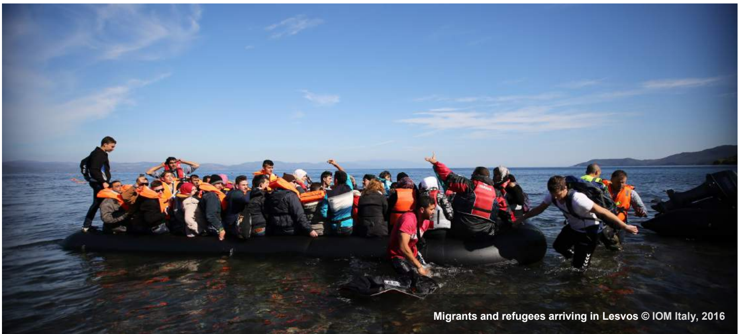
Migrants and refugees arriving in Lesbos

IOM has begun to procure and prepare non-food item kits to distribute to newly arrived migrants and refugees upon