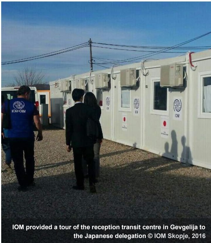
IOM provided a tour of the reception transit centre in Gevgelija to the Japanese delegation

IOM has completed the installation of 26 sleeping containers at the transit reception centre in Gevgelija to meet the needs of migrants and refugees at this centre. The containers are fully equipped with beds, linens, pillows, and blankets.