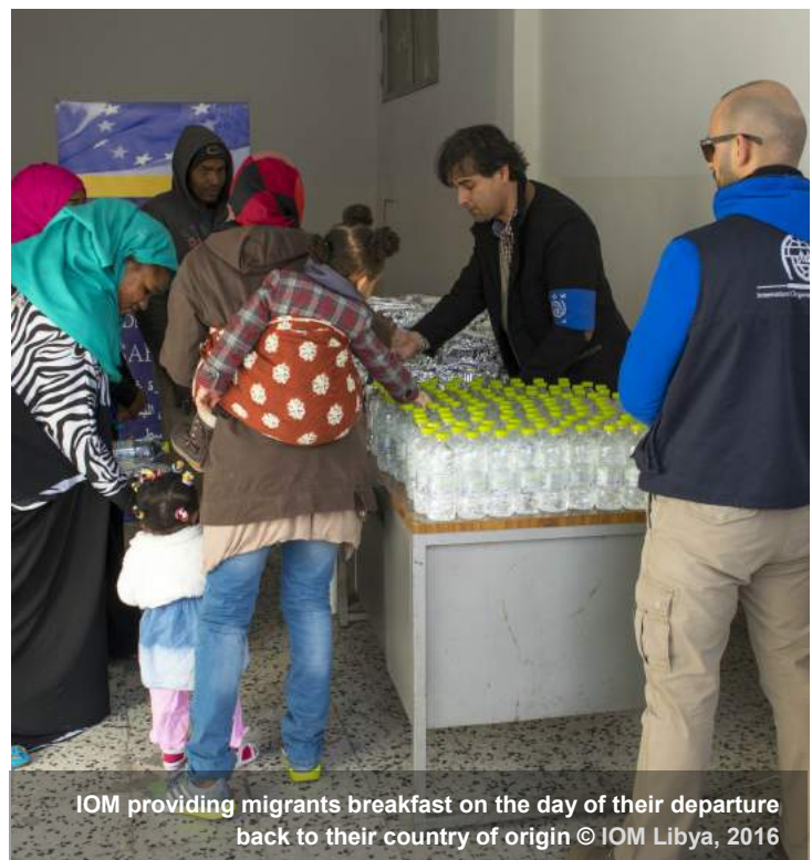
IOM providing migrants breakfast on the day of their departure back to their country of origin

The charter flight for the 117 Burkinabe migrants was organized in close coordination with the Embassy of Burkina Faso in Tripoli, the Libyan authorities and IOM Burkina Faso. Prior to their departure, the migrants stayed overnight at the Burkina Faso Embassy. IOM provided them with food, water and transport to the airport the following morning.