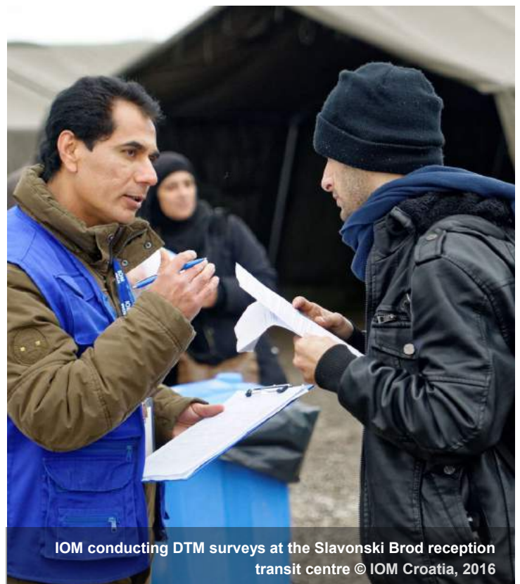
IOM conducting DTM surveys at the Slavonski Brod reception transit centre

Since the opening of the Slavonski Brod reception transit centre, IOM's DTM team has been present and consistently collecting data. The team currently has 10 data collectors and a mobility tracking assistant. As of 3 March, the DTM team has reported 3,300 successfully completed