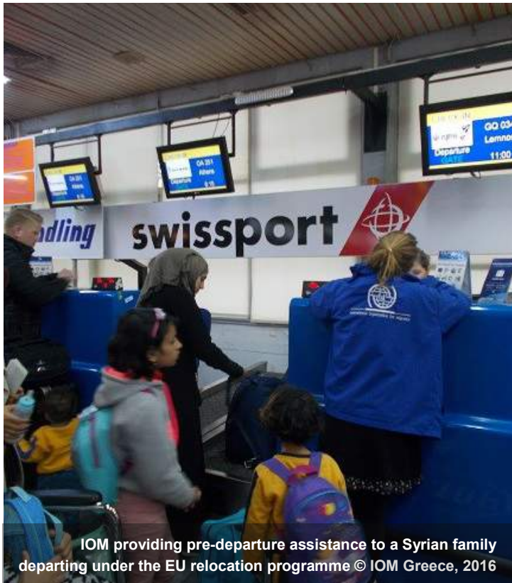
IOM providing pre-departure assistance to a Syrian family departing under the EU relocation programme

IOM continues to enhance the reception assistance at the First Reception Centres (FRC) in Lesvos, Evros and Leros through personnel who provide direct assistance to rescued migrants and refugees. At the FRCs, IOM also ensures that the screening of all newly arrived migrants and refugees happen immediately upon arrival in order to provide a prompt response to individual needs, as necessary.