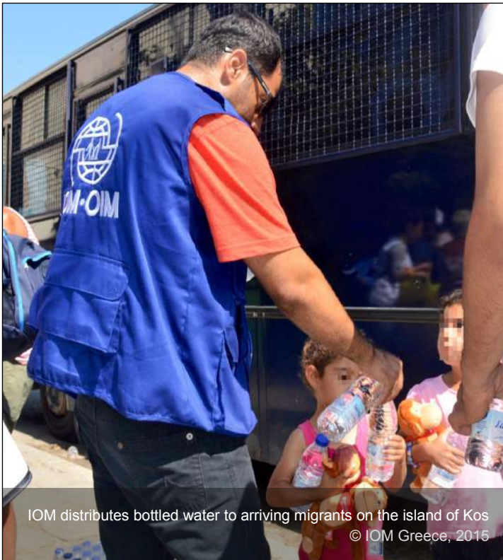
IOM distributes bottled water to arriving migrants on the island of Kos

IOM has established a permanent presence on the island of Kos. Along with gathering data on the migrant flows and identifying vulnerable migrants, IOM is also providing direct relief assistance to new arrivals at the entry points of the island.