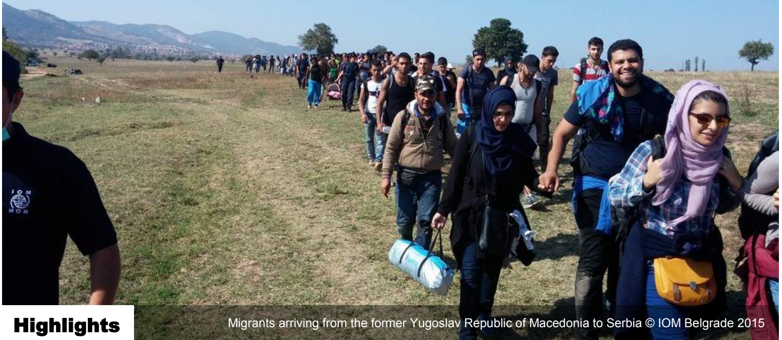
Migrants arriving from the former Yugoslav Republic of Macedonia to Serbia