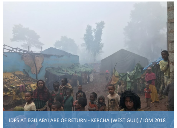
IDPS AT EGU ABYI ARE OF RETURN - KERCHA (WEST GUJI) / IOM 2018

IOM activities in response to the Gedeo and West Guji Crisis are supported by: