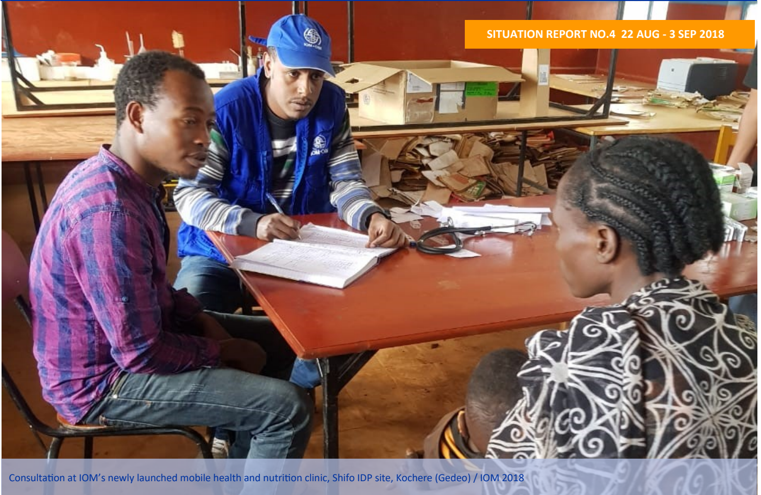
Consultation at IOM's newly launched mobile health and nutrition clinic, Shifo IDP site, Kochere (Gedeo)