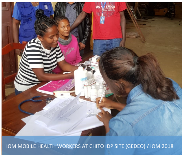
IOM MOBILE HEALTH WORKERS AT CHITO IDP SITE (GEDEO)

IOM plans to soon have a third mobile health clinic running in West Guji Zone, and has identified Kercha Woreda as a potential area for operation. Additionally, IOM plans to renovate a minimum of two existing health facilities damaged during the conflict. Assessments for this intervention are underway, and updates will be provided soon.