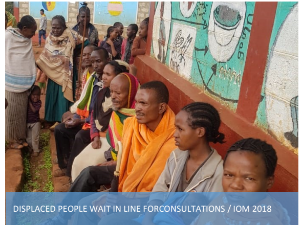
DISPLACED PEOPLE WAIT IN LINE FOR CONSULTATIONS

IOM plans to soon have a third mobile health clinic running in West Guji Zone, and has identified Kercha Woreda as a potential area for operation. Additionally, IOM plans to renovate a minimum of two existing health facilities damaged during the conflict. Assessments for this intervention are underway, and updates will be provided soon.