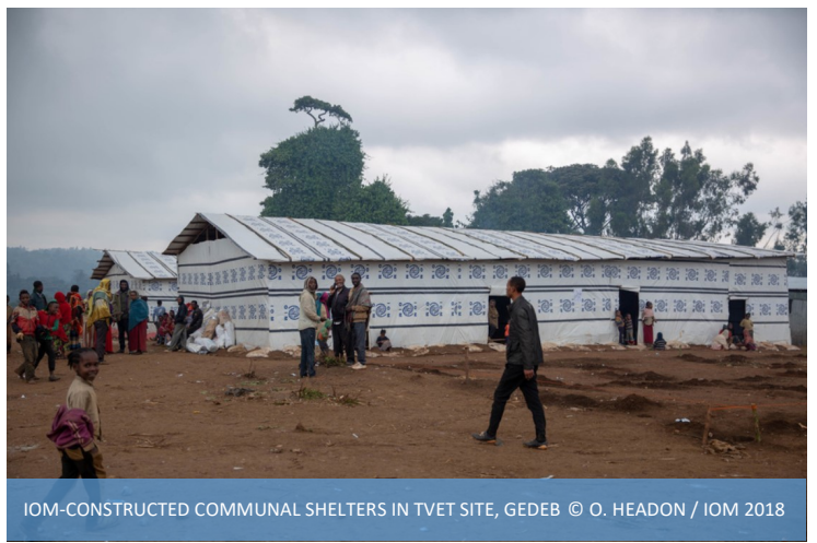
IOM-CONSTRUCTED COMMUNAL SHELTERS IN TVET SITE, GEDEB