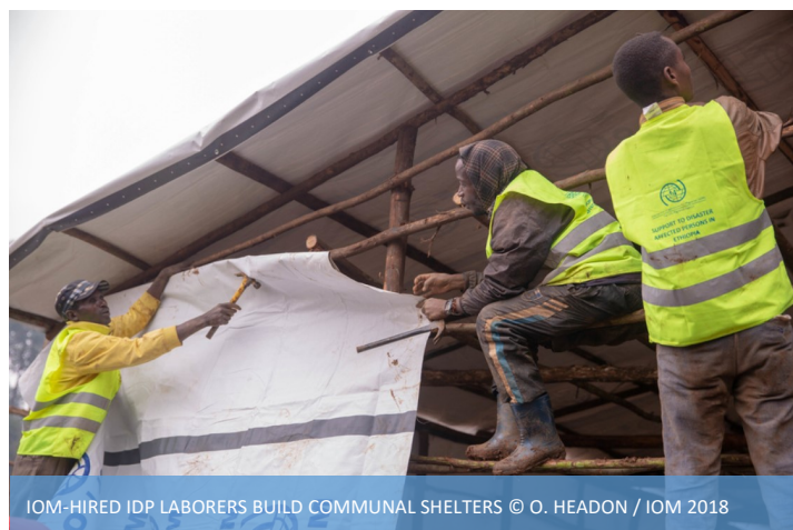
IOM-HIRED IDP LABORERS BUILD COMMUNAL SHELTERS