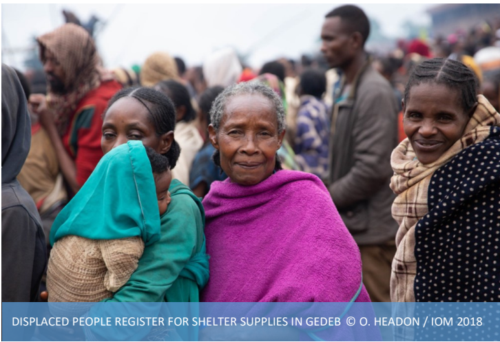
DISPLACED PEOPLE REGISTER FOR SHELTER SUPPLIES IN GEDEB