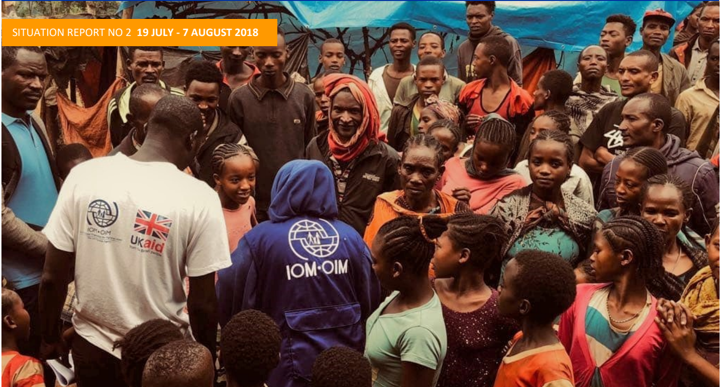
IOM STAFF WORKS WITH DISPLACED COMMUNITY IN ETHIOPIA'S GEDEO ZONE

SITUATION REPORT NO 2 19 JULY - 7 AUGUST 2018