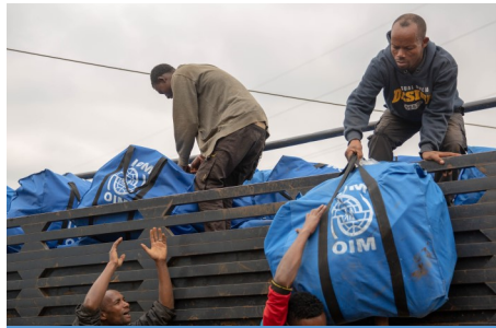
NFI KITS ARRIVE IN A SCHOOL SITE IN GEDEB