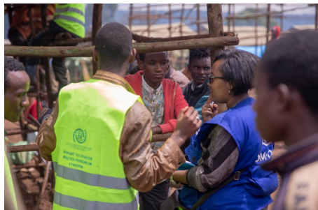
SHELTER TEAM CONSULTS ON CONSTRUCTION