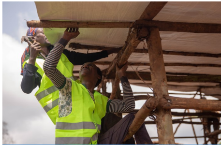
IDP LABOURERS CONSTRUCT A COMMUNAL SHELTER