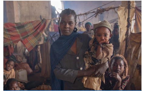
A DISPLACED WOMAN HOLDS HER CHILD IN THEIR SHELTER