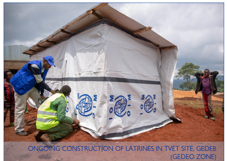
ONGOING CONSTRUCTION OF LATRINES IN TVET SITE, GEDEB (GEDEO ZONE)