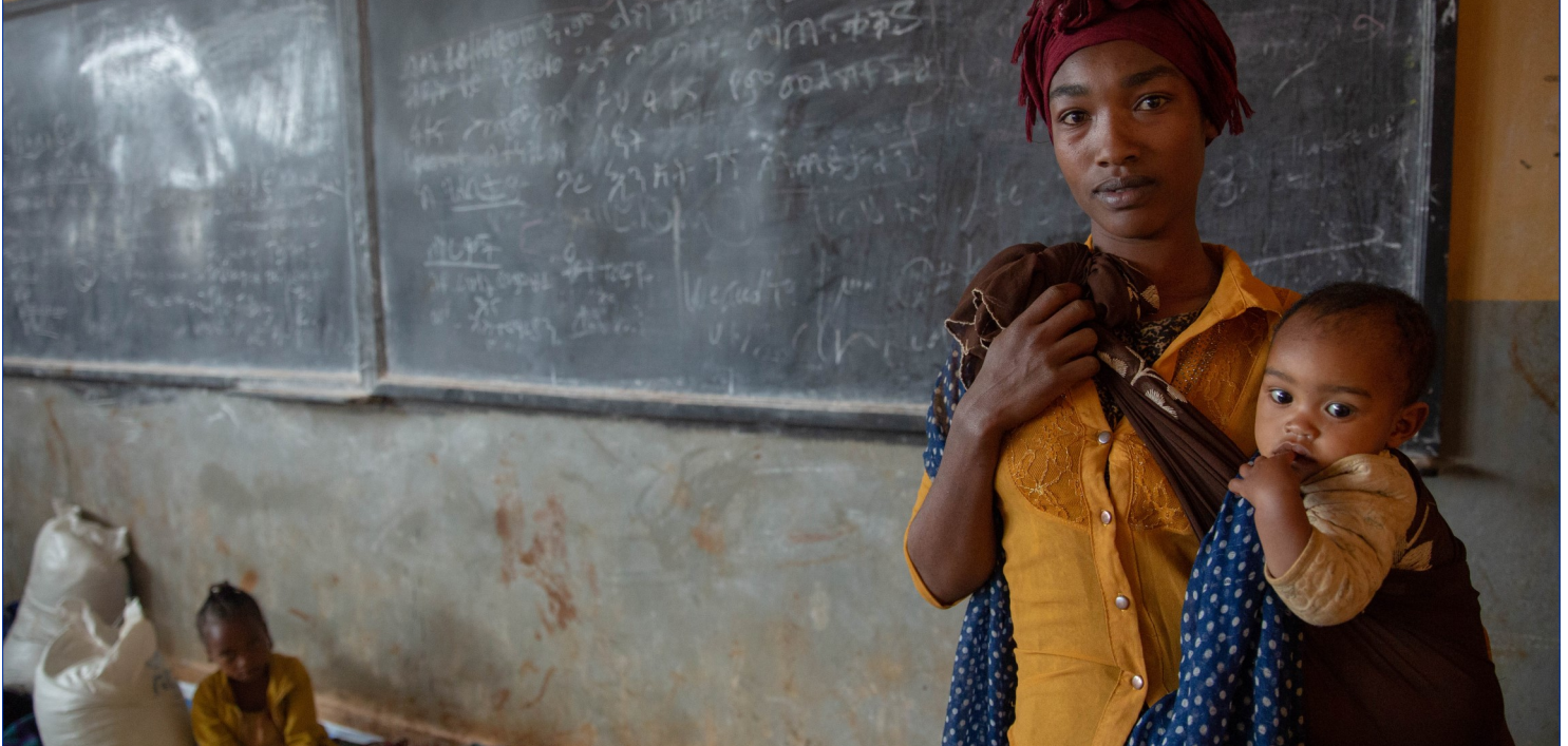
A DISPLACED WOMAN HOLDS HER CHILD IN THE CLASSROOM WHERE THEY AND NUMEROUS OTHERS ARE SHELTERING