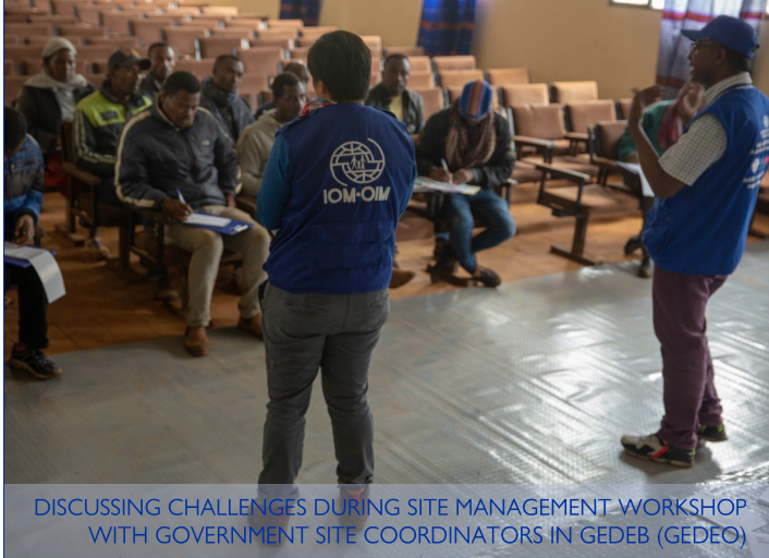
DISCUSSING CHALLENGES DURING SITE MANAGEMENT WORKSHOP WITH GOVERNMENT SITE COORDINATORS IN GEDEB (GEDEO)

IOM is supporting the Government at woreda (district) level, while setting up operations at site level. On 6 July, IOM launched its site management activities in Gedeb woreda (Gedeo zone) as it is hosting the largest amount of displaced people and has been prioritized by the Government.