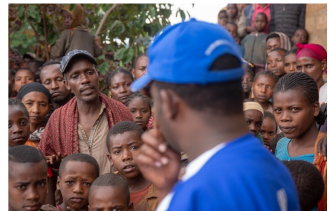
WASH TEAM SPEAKS WITH IDPS DURING ASSESSMENT