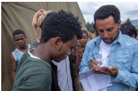
IOM SIGNS UP LOCAL VOLUNTEERS FOR THE RESPONSE