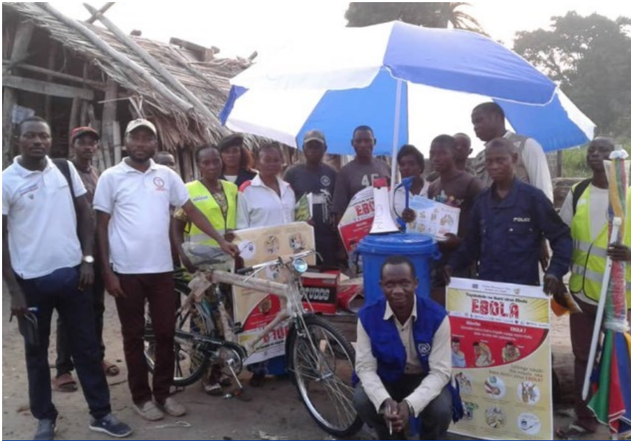
IOM CONDUCTS ASSESSMENT & SENSITIZATION AT POINTS OF ENTRY IN MBANDAKA, DRC, TO STOP EBOLA.