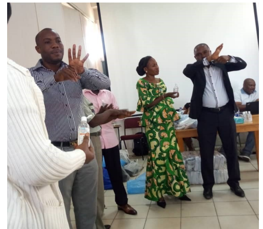
AT IOM'S TRAINING OF TRAINERS, 40 SUPERVISORS LEARNED THE USE OF GLOVES & HANDWASHING IN KINSHASA, DRC.

One month into the response, the primary focus of the response has moved to the most hard-to-reach and remote areas in Itipo and the greater Iboko Health Zone. IOM has supported the deployment of surveillance staff to Itipo , the current hot spot, in order to conduct and strengthen points of entry (POE) surveillance, risk communication, infection prevention and control (IPC), population mobility mapping (PMM) and daily flow monitoring. IOM's PMM will help in guiding the response, by understanding the mobility trends of the affected areas including hotspots.