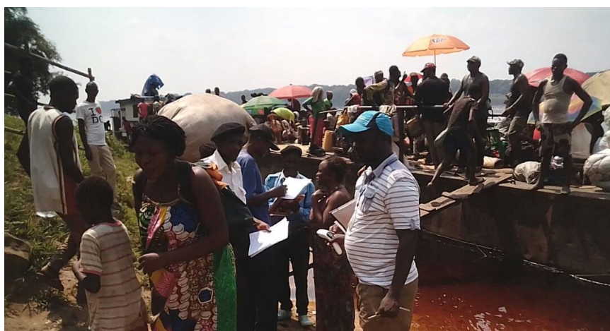
IOM SUPPORTS HEALTH SCREENINGS AT POINTS OF ENTRY SUCH AS RIVER PORTS, TO STOP EBOLA.

IOM is also conducting daily flow monitoring at 16 data collection sites in Mbandaka, Bikoro, Iboko, Ingenge and Lukolera , in order to understand the mobility volume and profiles of travelers, including internal and cross-border movements.