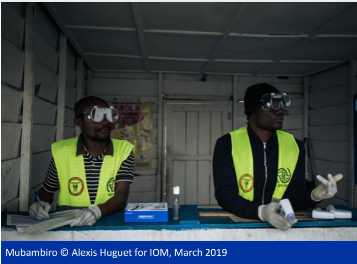
Mubambiro

On 10 April 2019, a medical doctor died in Beni from EVD. He had generated around 534 contacts, among them two frontline workers working at Mukulya POC (North-Kivu). All contacts, including the frontline workers, were listed by the surveillance commission and are being followed by the contact tracing team.