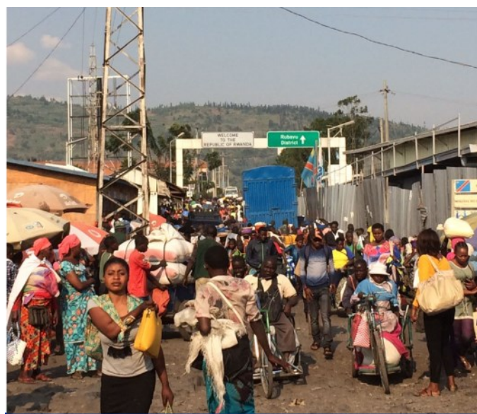
DRC'S MOST BUSIEST POINT OF ENTRY (PETITE BARRIER) IN GOMA

Cross border mobility between DRC- Uganda and Rwanda through major POEs such as Kasindi and Petite-Barrière is one of the highest in DRC. Approx. 25,000 people are crossing the border per day at Petite Barrier POE in Goma between DRC and Rwanda and over 10,000 people crossing per day at Kasindi POE between DRC and Uganda. Major purpose of travels are commercial purpose.