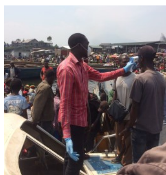
HEALTH SCREENING AT THE PORT

IOM will further assist Cross Border Coordination with neighboring countries, including Uganda and Rwanda and strengthen the International Health Regulations (2005) core capacities and public health emergency preparedness, through POE capacity assessment , developing standard operating procedure (SOP) and carrying out simulation exercise for contingency planning.