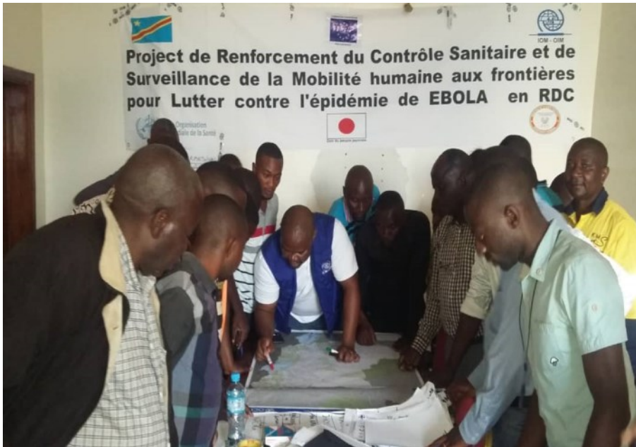
IOM CONDUCTS PARTICIPATORY MOBILITY MAPPING WITH COMMUNITY IN BENI, NORTH KIVU TO STOP EBOLA.