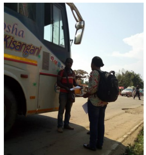
SENSITIZATION OF TRANSPORTATION DRIVERS AT IOM'S SUPPORTED POE IN MAVIVI, NORTH KIVU