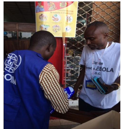
IOM AND PNHF STAFFS ARE SETTING UP POE SURVEILLANCE SITE

Population mobility, including cross-border movements, was identified as a significant risk for disease transmission in this outbreak due to the high number of traders and miners, displaced populations and insecurity caused by rebels and militias in the area. IOM and MoH have conducted joint assessments at points of entry (POE) in Mangina, Beni, Butembo and Goma to gauge the strength of the area's epidemiological surveillance system. IOM has supported the deployment of 10 epidemiologists, medical doctors and hygiene specialists to key border areas to conduct POE surveillance, risk communication, infection prevention and control (IPC) as well as Population Mobility Mapping (PMM) and daily flow monitoring. IOM's mobility mapping helps guiding the response, by understanding the mobility trends of the affected areas including hotspots where there is high volume of mobility and strong connection to the epicenter.