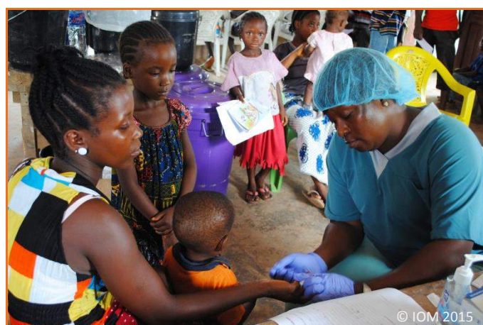
IOM provides primary health services to communities at the mobile clinic in Grand Cape Mount in Liberia

IOM is supporting County Health Teams in three counties to provide primary health services to communities through mobile clinics. In partnership with CHTs, IOM provides immunization, psychosocial support, reproductive health services, curative case services, family planning, and health education and triage at mobile clinics in Bomi (13), Grand Bassa (11) and GCM (13) with a total of 5,928 consultations.