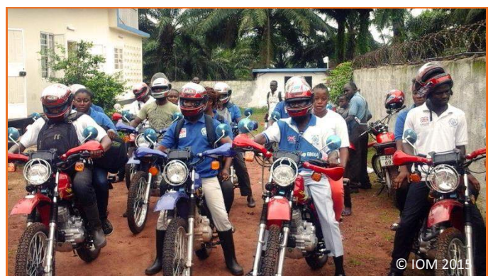
Roving monitors set off on motorbikes to support remote border posts in Kambia district, Sierra Leone

In collaboration with the RSLAF, a total number of 21 roving monitors and 80 staff of the Passenger Welfare Organization (PAWEL) have successfully deployed at 47 crossing points in the three chiefdoms of Gbileh Dixon, Samu, and Bramaia. On an ideal working day, teams set out in pairs on off-road motor bikes to cover the terrain and distances between designated crossing points to promote EVD awareness, handwashing resupply, support border agents and capturing mobility pattern data.