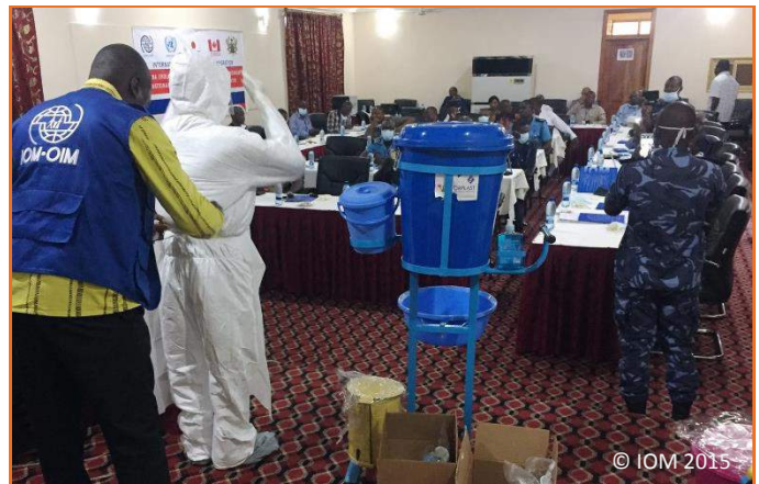
Border officials receive IPC and preparedness training in a Training of Trainers session at Koforidua, Ghana

In cooperation with Ghana Health Service's Port Health, IOM has trained 42 trainers from three government agencies. A three-day Training of Trainers took place in Koforidua from 15-17 July. The newly trained officials will now cascade the training they received to their peers in an effort to better prepare these frontline officers to include Ebola surveillance in their daily work. The training covered other communicable diseases, promoted basic hygiene and sanitation, and rolled out new Standard Operating Procedures (SOPs) for strengthened border health surveillance in Ghana.