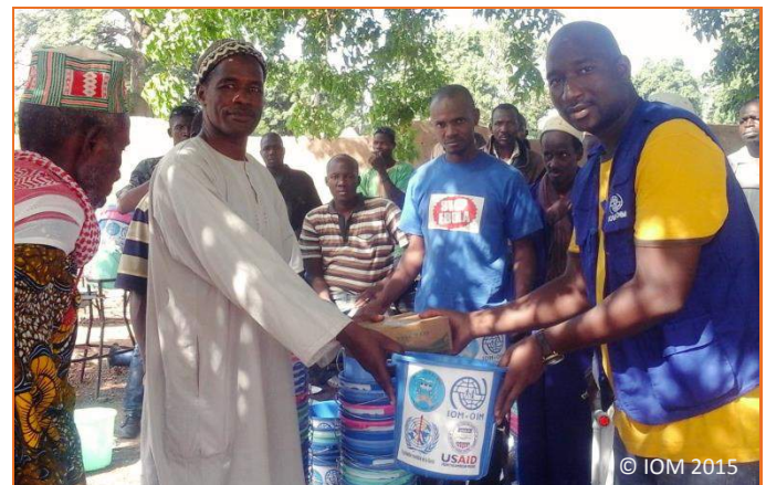
IOM engages and empowers border communities to strengthen EVD surveillance and response in Mali

IOM is supporting the Government of Mali by strengthening early warning systems and monitoring mechanisms and to identify suspected cases at Points of Entry in the rural communes of Faléa and Kéniéba. The goal is to involve grassroots communities in the response to EVD and strengthen warning mechanism to identify suspected cases of EVD in communities around gold mining sites. A pilot initiative is expected to cover 21 villages in the rural town of Faléa.