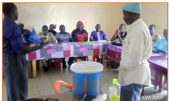
IOM delivers EVD awareness and preparedness training to community leaders in Kédougou, Senegal to strengthen local capacity to respond to EVD

From 8-11 July, IOM held two training workshops on EVD preparedness. The objective of the workshops was to strengthen the capacity of participants on EVD symptoms, detection, modes of transmission, and prevention. A total of 50 people were trained, mainly community leaders and traditional healers. The workshops were conducted in the local languages of Pulaar and Mandinka to ensure better understanding of vital preparedness measures.