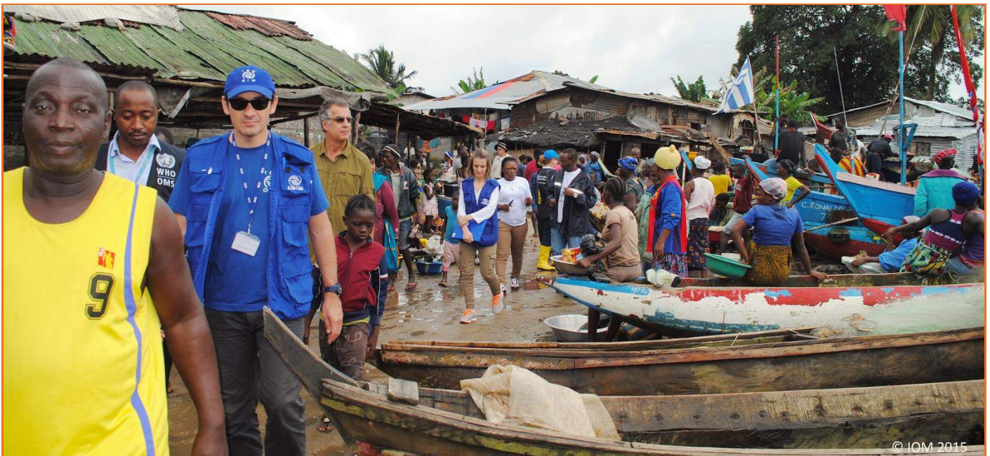
IOM, CDC, and WHO conduct a joint assessment of population mobility, community health event-based surveillance, and border management best practices at a fishing village in Fanti Town, Liberia