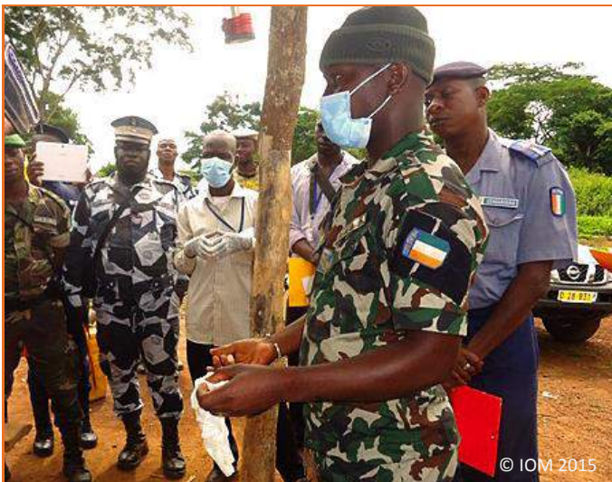
IOM delivers IPC and EVD preparedness training to border officials in Ohidougou, Côte d'Ivoire

epidemiological data, in order to provide a more robust and effective public health interventions, communicable disease response, and border health interventions.