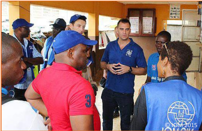
IOM staff from Guinea and Sierra Leone meet to discuss cross-border collaboration and harmonization of EVD interventions in Freetown, Sierra Leone