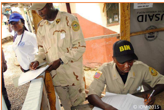
IOM mentors Bureau of Immigration and Naturalization agents, registering travellers at the Flow Monitoring Point at Bo Waterside in Liberia

In response to the recent outbreak in Margaribi, IOM expanded operations to provide support at additional county checkpoints, including infrastructure, screeners, training and supplies. During the reporting period IOM supported the activation of three checkpoints in Grand Bassa, as well as support to two checkpoints in Bomi, bordering Gbarpolu. IOM continues to provide support to six Points of Entry (PoE), one unofficial border crossing point and two checkpoints in Grand Cape Mount (GCM) County. IOM also provides operational support and mentorship to County Health Teams (CHT) and border screening in GCM.