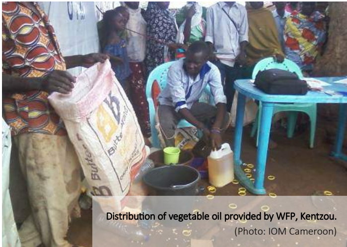
Distribution of vegetable oil provided by WFP, Kentzou.

On 15 October, IOM distributed food (maize, vegetable oil and peas) provided by WFP to 320 households (1,573 individuals) in Kentzou and Garoua Boulai. Additionally, during the reporting period, IOM distributed NFIs including jerry cans, mosquito nets and blankets to 18 individuals hosted in IOM's transit site in Kentzou.