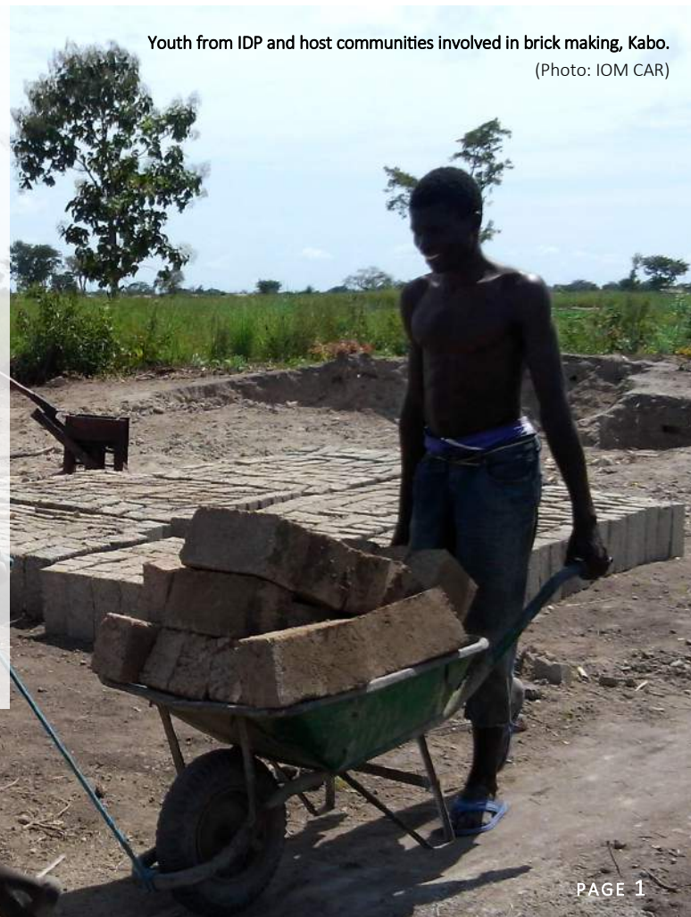
Youth from IDP and host communities involved in brick making, Kabo.

REPUBLIC OF CONGO: IOM provided evacuation assistance to a 19 year old third country national (TCN) from Senegal to return to her country of origin and reunite with her family.