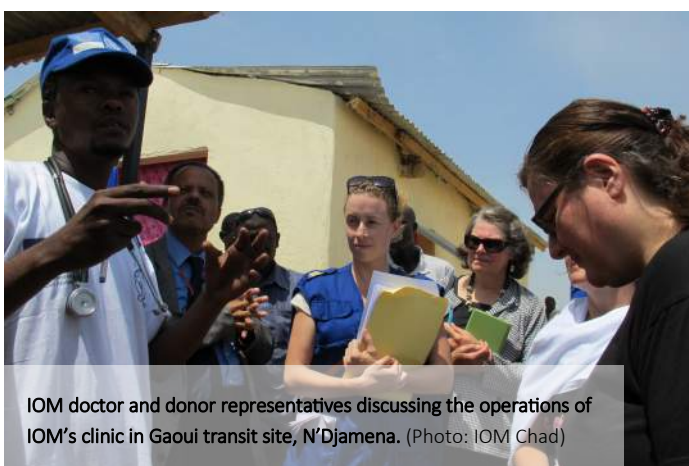
IOM doctor and donor representatives discussing the operations of IOM's clinic in Gaoui transit site, N'Djamena.

During the reporting period, IOM together with donor representatives from the European Commission and the United States Government visited N'Djamena and Sarh. The purpose of their visit was to understand the current situation of returnees, CAR-claiming nationals and TCNs currently hosted in the transit and temporary sites.