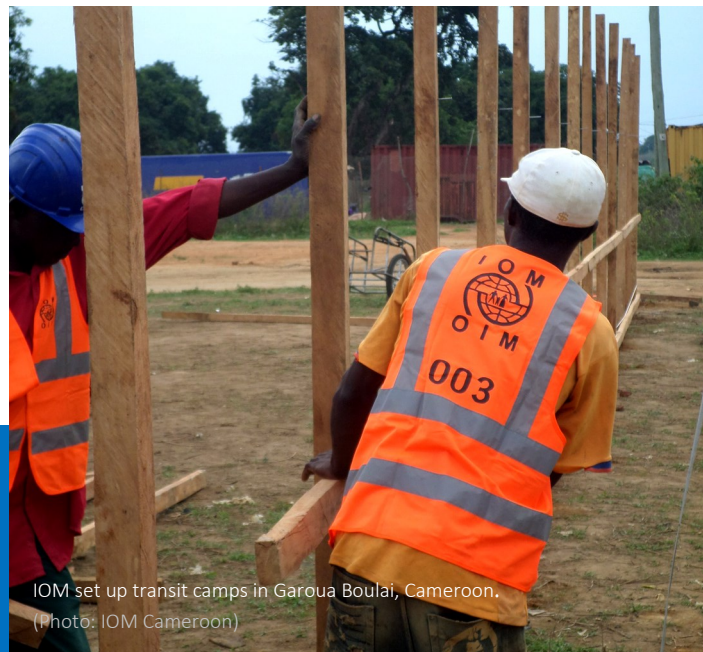
IOM set up transit camps in Garoua Boulai, Cameroon.

Discussions are ongoing with Nigerian and Senegalese Embassies to scope how IOM can support transportations to return migrants by land and air.