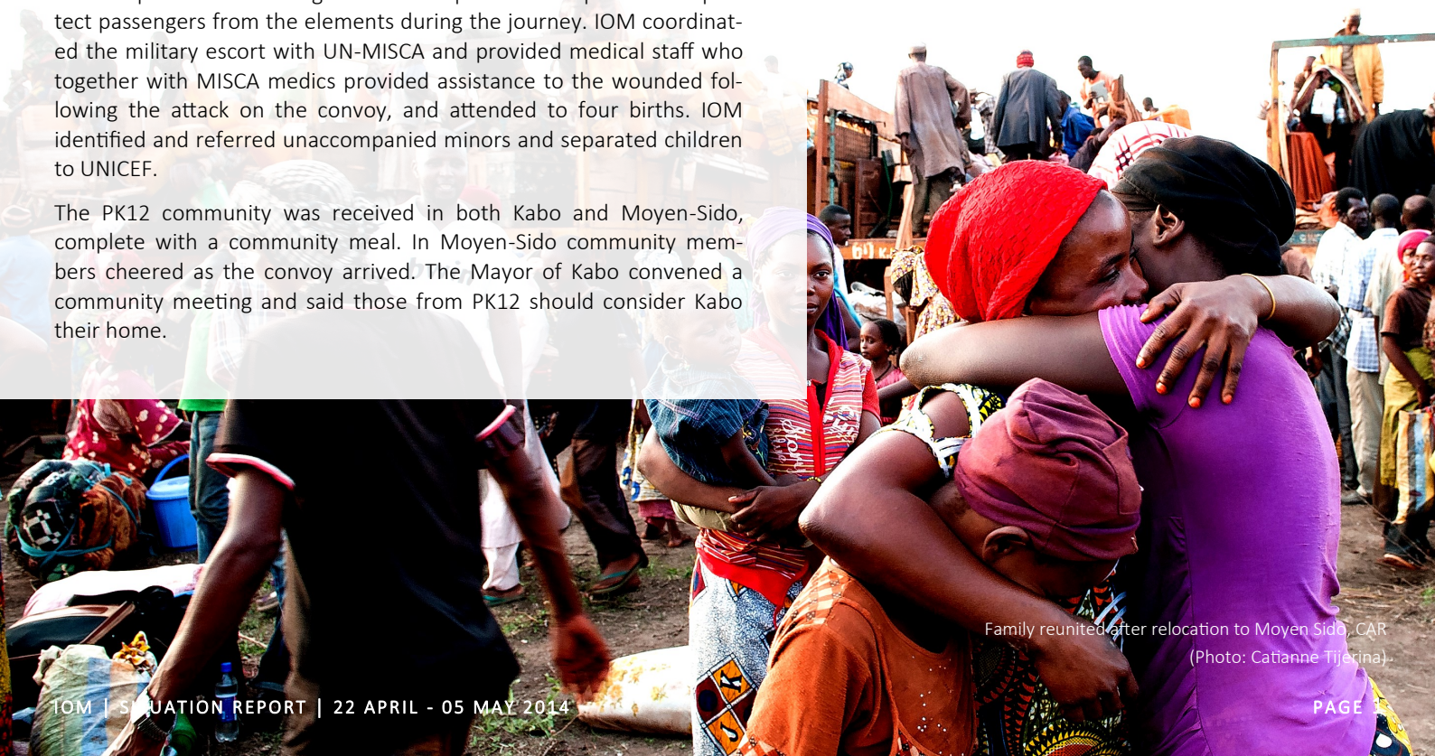
Family reunited after relocation to Moyén Sido, CAR

CHAD: Chagoua transit site in N’Djamena closed on 23 April.