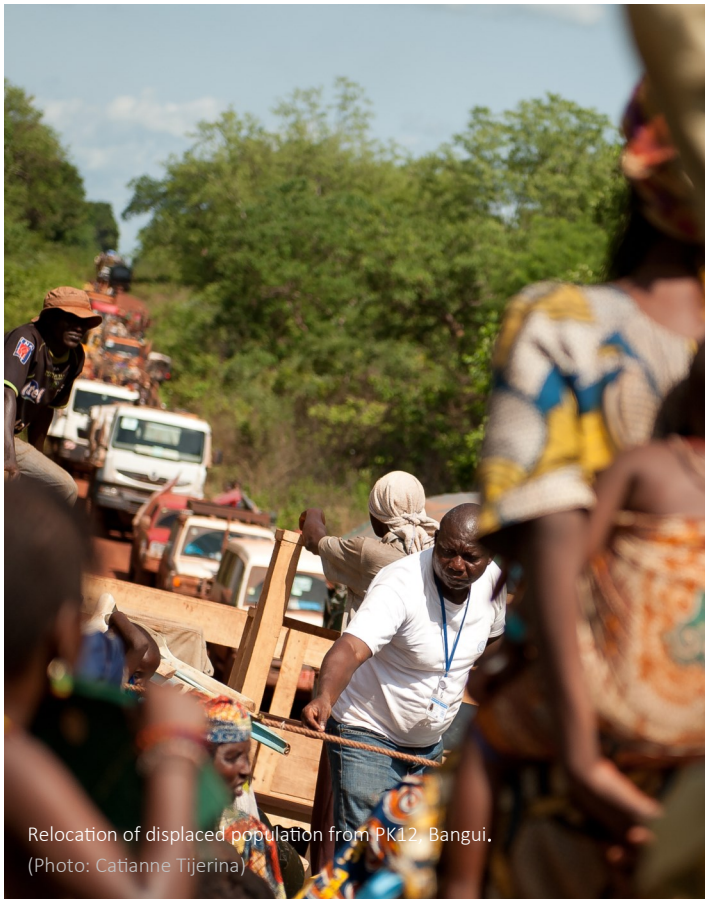
Relocation of displaced population from PK12, Bangui.