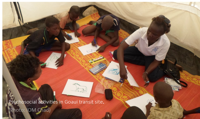
Psychosocial activities in Goauï transit site.

On 03 May, a football game was organized for the male youth in Gaoui transit center. In the Sido transit site, 194 persons were involved in the diffusion of key messages on promotion of peace and peaceful coexistence. Prevention on gender based violence messages were also disseminated, targeting 435 persons.