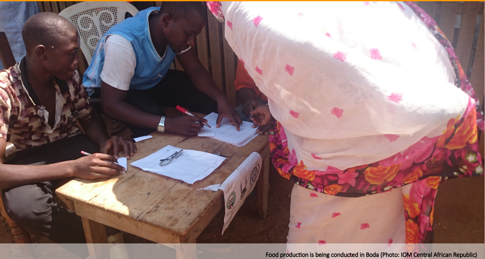
Food production is being conducted in Boda