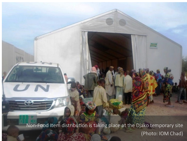
Non-Food Item distribution is taking place at the Djako temporary site

The clinic in Gaoui transit site carried out a total of 295 consultations in the reporting period. IOM clinic personnel referred eight cases to hospitals. The consultations resulted in 92 identified cases of malaria with the remaining cases consisting of respiratory infections, Sexually Transmitted Infections (STIs), tuberculosis, and dental referrals.