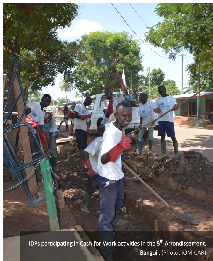
IDPs participating in Cash-for-Work activities in the 5 th Arrondissement, Bangui .

CAMEROON: IOM is increasing the number of latrines in transit sites in Garoua Boulai and Kentzou.