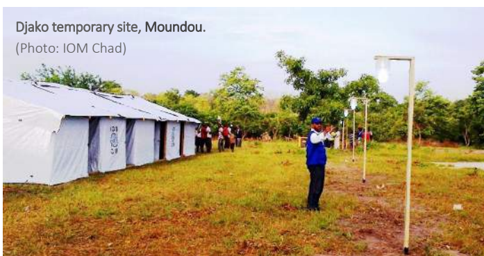
Djako temporary site, Moundou.

IOM continues to expand the shelters in Djako temporary site to receive the remaining caseload of Chadian migrants who fled CAR and are still stranded in Cameroon. IOM is currently acting as the site manager of Djako temporary site and has constructed 10 emergency communal shelters and 212 emergency individual shelters in the site so far. A total of 250 individual shelters will be built on the site. Moreover, IOM has also installed a generator to ensure that there is light on the site. UNICEF is providing water, sanitation and hygiene (WASH) assistance, IRC is providing health assistance and WFP is responsible for food distribution at the temporary site.