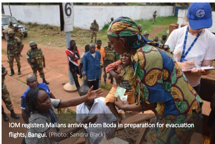
IOM registers Malians arriving from Boda in preparation for evacuation flights, Bangui.

Now I am here in this camp with two of my children and my granddaughter. It’s very hard here because there is little water and no electricity. An NGO came two weeks ago and put up some tents. There is a faucet nearby on land owned by Muslims, but nowhere for us to charge our phone batteries. When it rains a lot, we don’t go outside because there is lots of mud. I hope that in the future, stability and peace will return to my country and we can go home.”