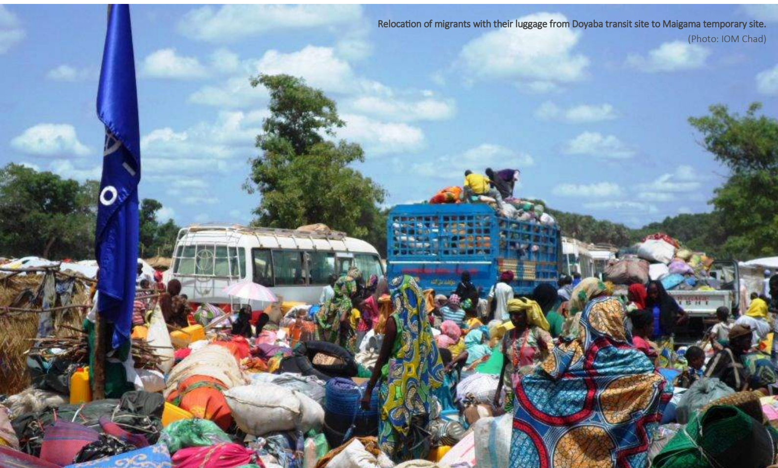
Relocation of migrants with their luggage from Doyaba transit site to Maigama temporary site.