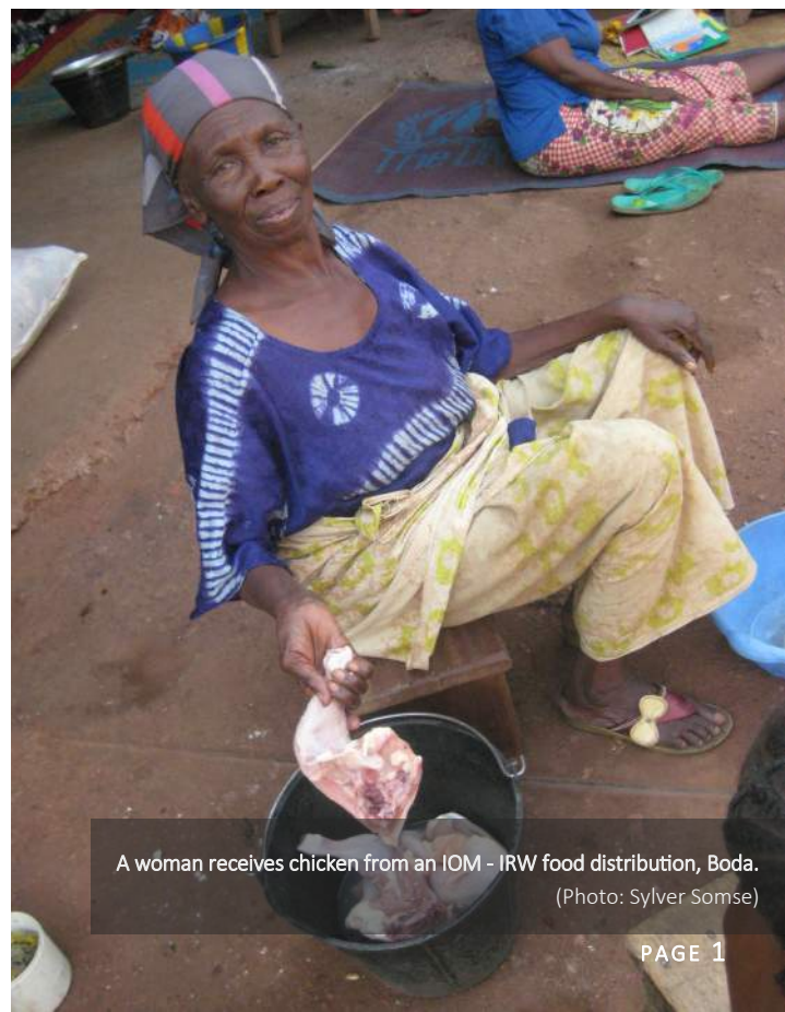
A woman receives chicken from an IOM - IRW food distribution, Boda.

CAMEROON: On 22 July, IOM provided 528 Chadian migrants with evacuation assistance from Garoua Boulai to Djako, Chad.