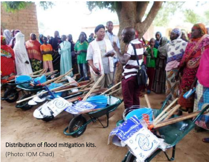
Distribution of flood mitigation kits.

The rainy season in southern Chad caused significant damage to shelters in both transit and temporary sites. In July, IOM began distributing emergency shelter and flood mitigation kits to residents of Doba, Doyaba and Sido transit sites to mitigate damages caused by the rains. So far, a total of 65 flood mitigation kits have been distributed to 65 Chefs de Secteurs hosted in Doyaba transit site. Each Chef de Secteur , through the establishment of sub-committee, will ensure the provision of flood mitigation assistance to the respective households. The flood mitigations kits are composed of excavators, buckets, picks, hoes, wheelbarrows and rakes.