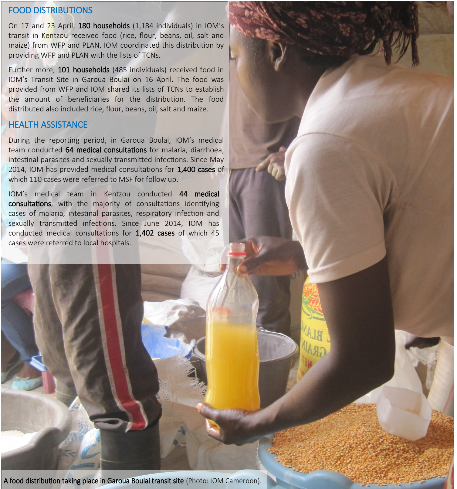
A food distribution taking place in Garoua Boulai transit site (Photo: IOM Cameroon).

IOM's medical team in Kentzou conducted 44 medical consultations , with the majority of consultations identifying cases of malaria, intestinal parasites, respiratory infection and sexually transmitted infections. Since June 2014, IOM has conducted medical consultations for 1,402 cases of which 45 cases were referred to local hospitals.