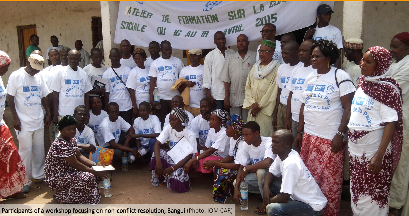
Participants of a workshop focusing on non-conflict resolution, Bangui