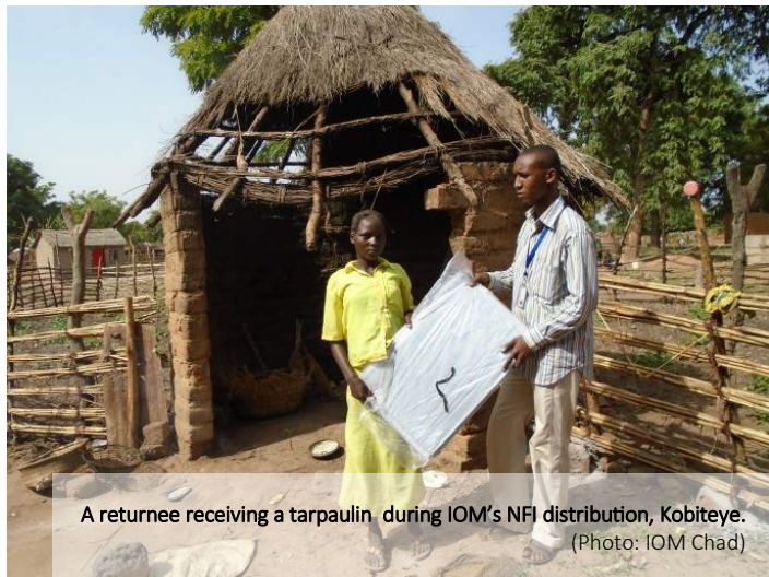
A returnee receiving a tarpaulin during IOM's NFI distribution, Kobiteye.

Moreover, on 19 May, 330 tarpaulins were distributed to the most vulnerable returnees in Kobiteye to enable the repair of their shelters.