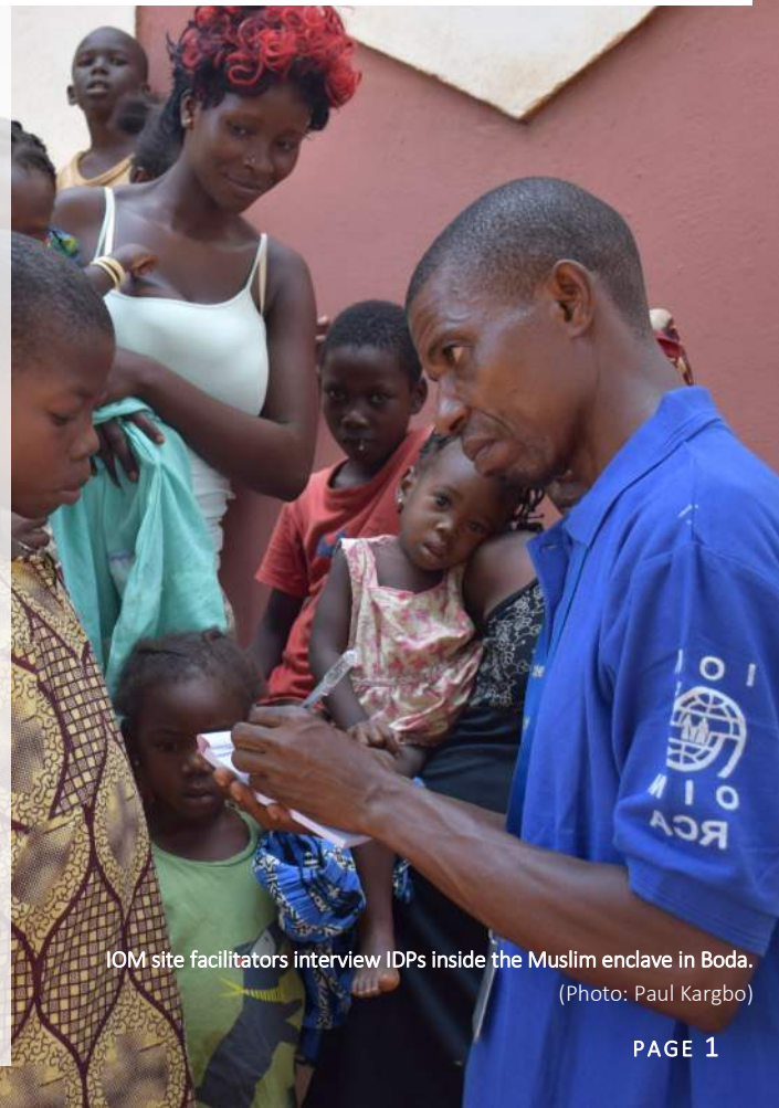
IOM site facilitators interview IDPs inside the Muslim enclave in Boda.

CAMEROON: IOM conducted medical consultations with 157 TCNs in Kentzou and Garoua Boulai and referred 17 severe health cases to local hospitals and MSF.