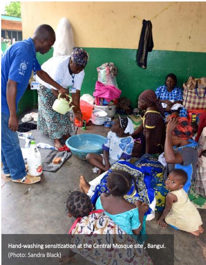
Hand-washing sensitization at the Central Mosque site , Bangui.