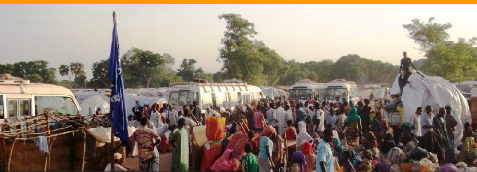
Transportation of returnees, CAR-claiming nationals and TCNs to Maigama temporary site.