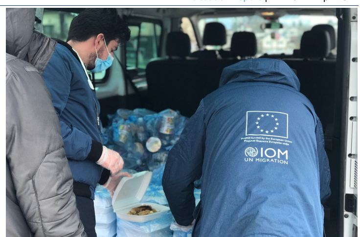
Non-food items distributed during outreach

IOM thanks to the Instrument contributing to Stability and Peace (IcSP) project. Lastly, IOM's Outreach team delivered 70 food packages to the SFA at PC Lipa, for migrants and asylum seekers arriving at the camp outside food distribution hours.