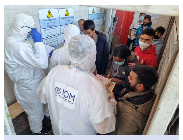
Distribution of board games in TRC Miral