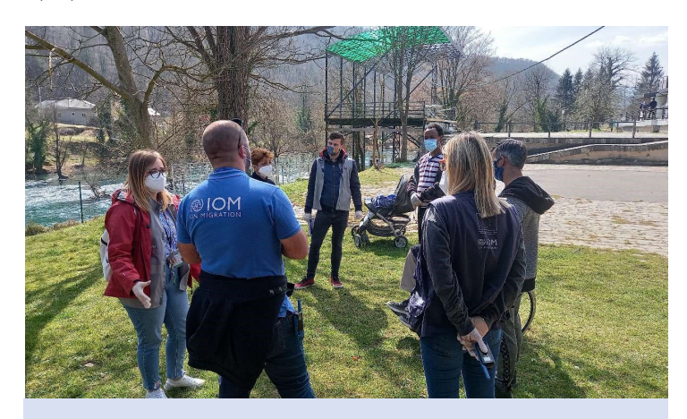
Community Representative Meeting in TRC Sedra

In TRC Borići, during the Feedback and Complaint Committee meeting, migrants and asylum seekers were informed that during the next Community Representatives meeting, they will be given guidance on how to submit a written complaint containing all relevant information for their complaints to be adequately followed up upon.