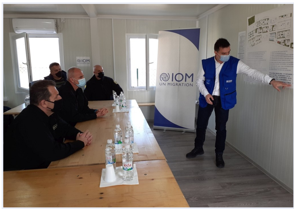
IOM updating Minister of Security and SFA on the construction work developments in TRC Lipa