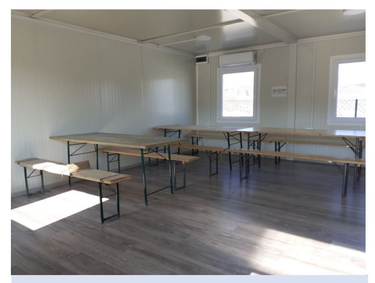
Conference room set up in a double container in TRC Lipa

To increase monitoring of migrants and asylum seekers who are currently in isolation areas, IOM hired additional security staff (6 in Miral and 1 in Sedra). Furthermore, IOM reiterated to migrants and asylum seekers to strictly follow COVID-19 prevention measures, and as such abstaining from any close communication and exchange of personal belonging over the fence with migrants outside the centre to avoid transmission of the COVID-19 virus.