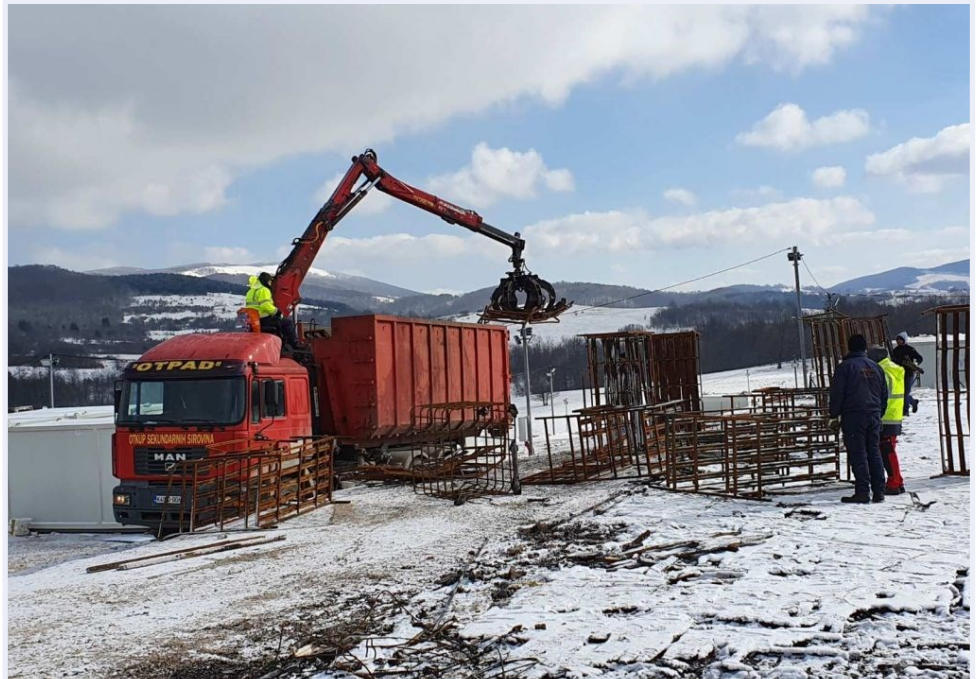
Clearing process of leftover debris in former camp Lipa