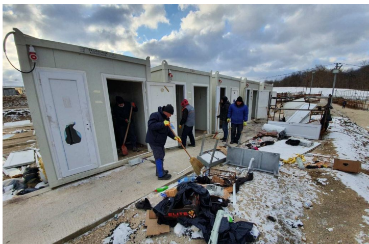
Cleaning action by IOM and partner agencies in former Lipa camp