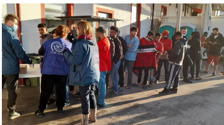
NFI distribution, TRC Miral

The local community continues to be dissatisfied with the situation, which resulted in several security incidents involving the IOM outreach team, where local citizens verbally attacked the team and attempted to interfere with IOM vehicle movements.