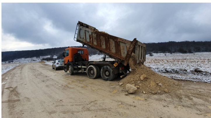
Sand gravel distribution in PC Lipa access road

Furthermore, the German Federal Agency for Technical Relief (THW) visited PC Lipa with the contractor for a final assessment of setting up the medical corner, and the construction work started on 17 February.