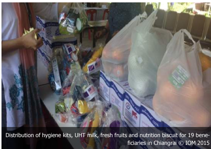
Distribution of hygiene kits, UHT milk, fresh fruits and nutrition biscuit for 19 beneficiaries in Chiangrai

More than 700 sets of monthly hygiene kits containing anti-bacteria soap, shampoo, tooth brush, toothpaste and detergent powder were distributed to detainees in IDCs and to women and children in 20 locations covering 8 provinces. As cool season is approaching, warm jackets were provided to 20 beneficiaries who are sheltered in Chiangrai province. A washing machine was provided for 116 detainees at Phang-nga IDC to improve and promote hygiene condition of the cells. Furthermore, at Phang-nga shelter, household items and cleaning material such as brooms, dishwashing liquid, floor cleaner were provided in support to 44 Myanmar Muslim women and children.