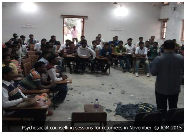
Psychosocial counselling sessions for returnees in November

During November IOM also coordinated the safe return, family reunification, and follow up visits of the two unaccompanied minors together with UNICEF and the Bangladesh Red Crescent Society. IOM is also coordinating the operationalisation of a framework to address the human smuggling and trafficking by sea, in line with government strategy and plan of action on counter trafficking.