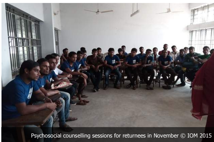
Psychosocial counselling sessions for returnees in November

As of 30 November, the total number of returnees is 2,266. To date IOM has provided return assistance to 2,210 Bangladeshi nationals including a reinsertion grant for 1,197 Bangladeshis.