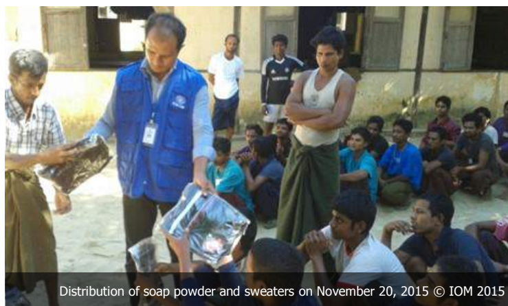
Distribution of soap powder and sweaters on November 20, 2015

IOM continues to work to upgrade the basic facilities of Taung Pyo, including building 7 new latrines, installing new roofing, repairing doors, windows and sleeping areas, and building a permanent kitchen block. The upgrades have been coordinated with BGP and will be completed by mid-December.