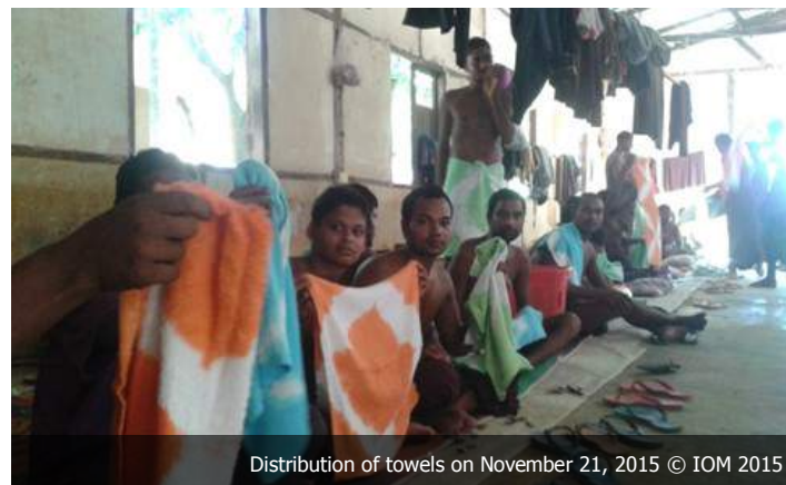
Distribution of towels on November 21, 2015

MSF continues to provide psychosocial counselors who visit 3 times per week. On 6 November CFSI received approval to access Taung Pyo and began visiting to conduct psycho-social activities, particularly for children and adolescent girls. Daily visits were conducted from 09 November following the election.