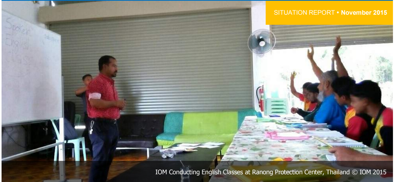
IOM Conducting English Classes at Ranong Protection Center, Thailand