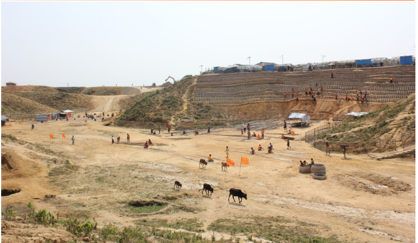
SLOPE STABILIZATION AND DRAINAGE DEMARCATON IN CAMP 20 EXTENSION.