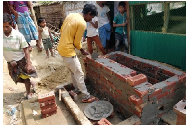
CONSTRUCTION OF PLATFORM FOR TAP STANDS OF WATER PIPELINE NETWORK.