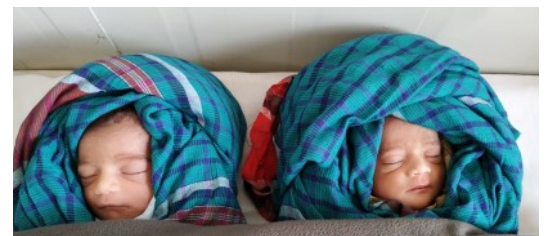
MADHURCHARA PRIMARY HEALTH CARE CENTRE DELIVERED ITS FIRST SET OF TWINS IN FEBRUARY. THE PARENTS ARE HOST COMMUNITY MEMBERS.

391 Deliveries conducted in IOM facilities by skilled birth attendants in February