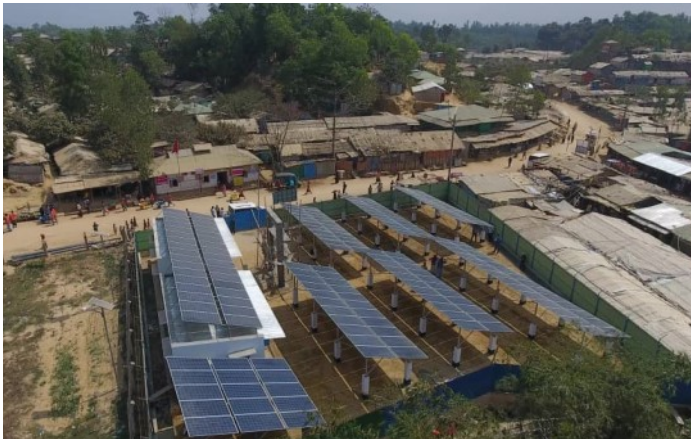
BIRD'S EYE VIEW OF THE AFFIXED SOLAR PANELS FOR WATER PIPELINE NETWORK IN CAMP 12.

The IOM WASH team has received the site plan for Camp 19 and 20 Extension. Based on this plan, IOM WASH unit has begun the process of assessing WASH infrastructure needs in Camp 19 and 20 Extension. In addition, IOM will install small scale water pipeline network in Camp 20 Extension to ensure safe drinking water to approximately 750 people. The planned pipeline network will supply 15,000 liters/day maintaining the WASH sector agreed standard of 20 liters per capita.