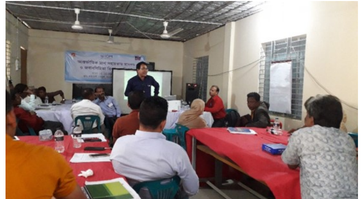
TRAINING ON INTERNATIONAL HUMANITARIAN ASSISTANCE AND ACCOUNTABILITY IN PALONG KHALI UNION, UKHIYA.

As per the proposed activities in the Risk Reduction Action Plan (RRAP) of communities, DRR team along with UDMC members identified Disaster Risk Mitigation schemes in Sabrang, Hnila, Rathna Palong and Haldia Palong for engineering estimation. The engineering estimation will help give a thorough understanding on the works needed to be done to reduce the risk of disaster in the affected area.