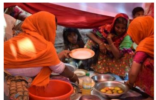
MEMBERS OF TEN FAMILIES ATTEND A COLLECTIVE KITCHEN EVENT IN CAMP 15.