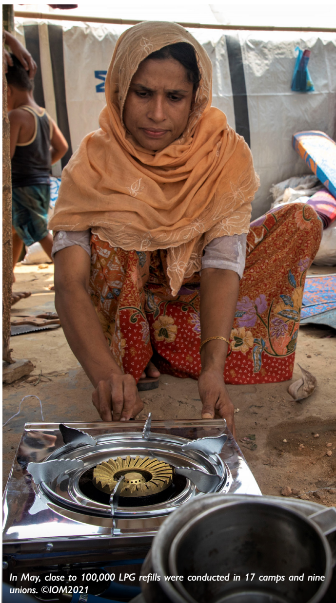
In May, close to 100,000 LPG refills were conducted in 17 camps and nine unions.

In May, 111 individuals living in fire-affected host community areas in Camps 9 and 8E were identified for shelter support and eight community members received shelter training. A total of 91 shelters in Camp 9 and 25 shelters in Camp 8E underwent the second phase of shelter construction. Several refugee families moved into the completed shelters.