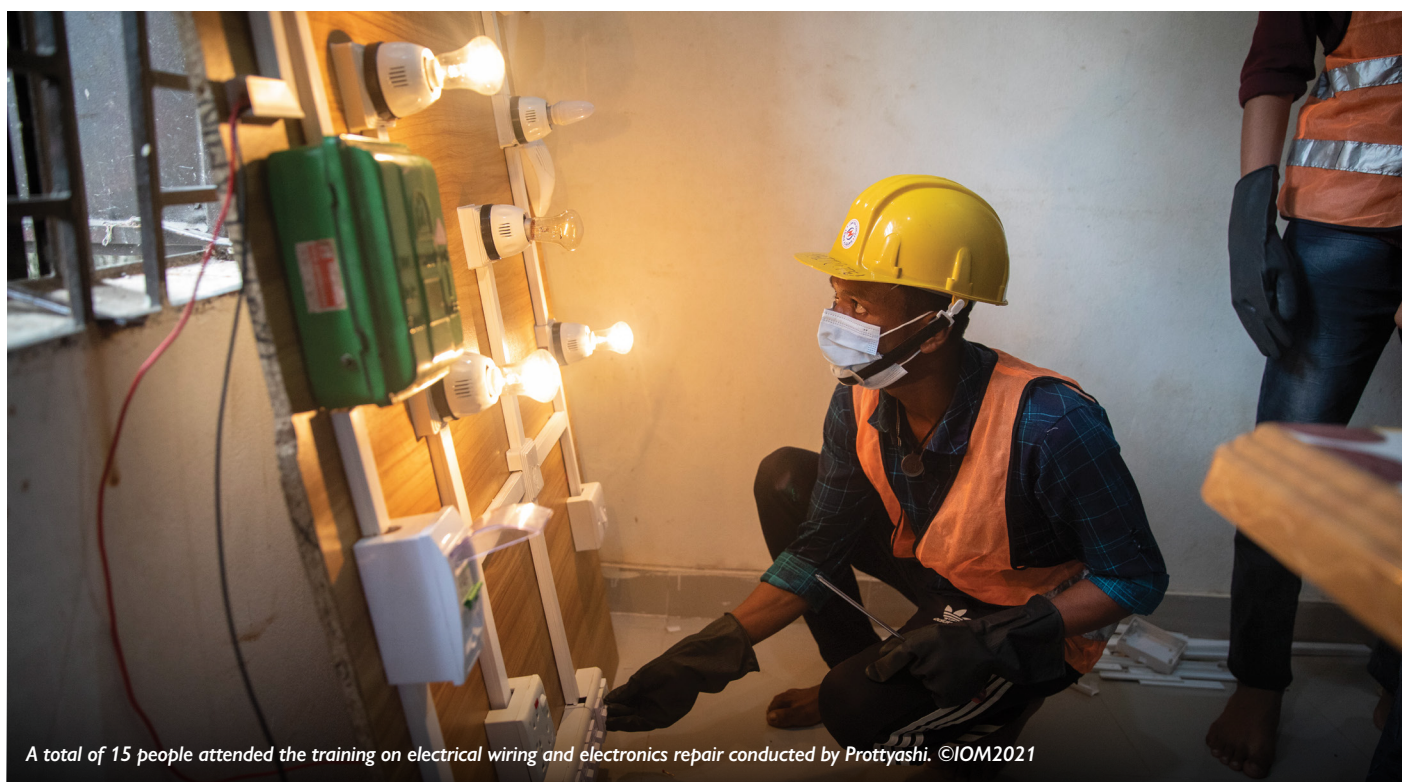
A total of 15 people attended the training on electrical wiring and electronics repair conducted by Protyyashi.

In addition to the livelihood skills development training, to improve their business management skills, 20 participants attended training sessions on market linkage, product marketing, cost minimization, and customer satisfaction. Another 81 individuals attended a training on Entrepreneurship Development, during which they learned to develop business plans, assess cost-benefits, analyze market demands, and create marketing and financial plans.