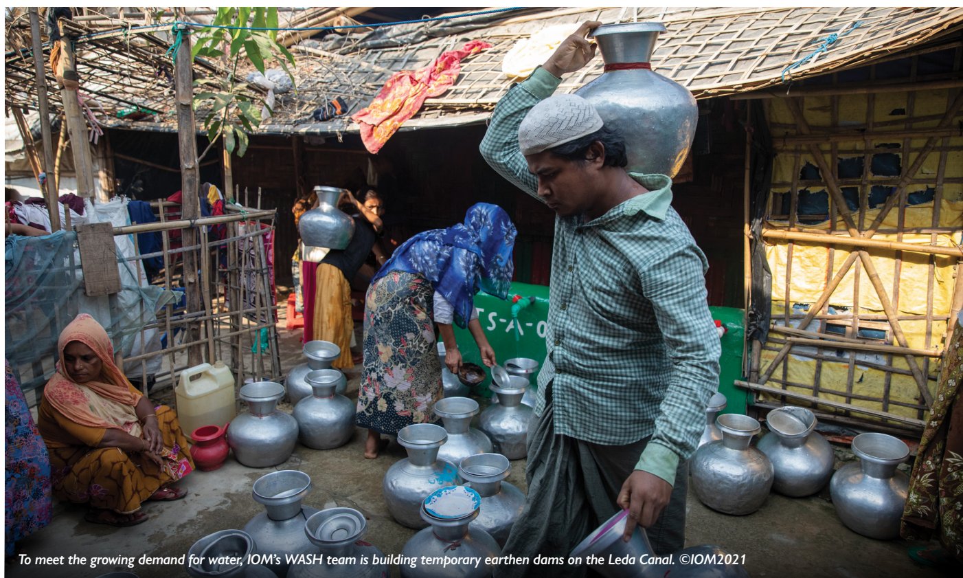
To meet the growing demand for water, IOM's WASH team is building temporary earthen dams on the Leda Canal.