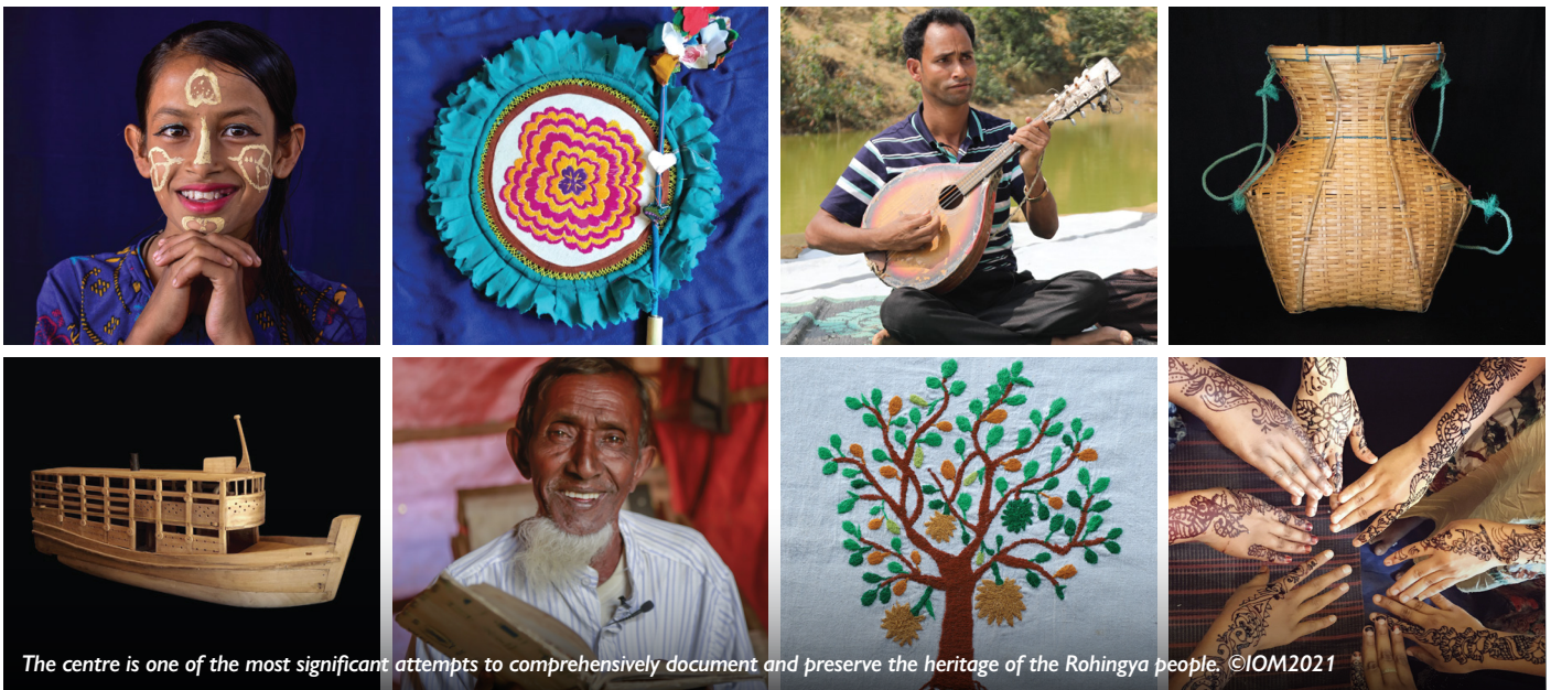
The centre is one of the most significant attempts to comprehensively document and preserve the heritage of the Rohingya people.