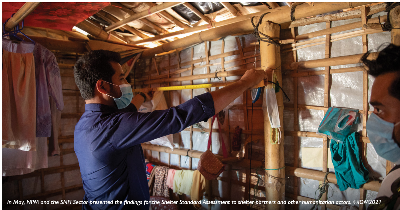
In May, NPM and the SNFI Sector presented the findings for the Shelter Standard Assessment to shelter partners and other humanitarian actors.

IOM NPM continues to support the Site Management Sector with the Incident Reporting Mechanism. More information on incidents can be found in this dashboard . NPM facilitated two online refresher training courses for SM staff in all camps and supported SMSD to launch the Daily Incident Mechanism for 2021.