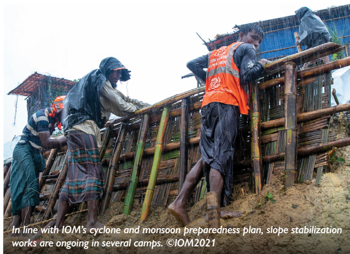
In line with IOM’s cyclone and monsoon preparedness plan, slope stabilization works are ongoing in several camps.

During the reporting month, IOM published the report “ MaBoinor Rosom ” (MBR), which means “Mother’s and Sister’s Way” or “Mother’s and Sister’s Traditions” in Rohingya. The report and accompanying curriculum were developed as a series of workshops where Rohingya women and girls can learn more about issues that affect them, as well as share their thoughts, experiences and ideas.