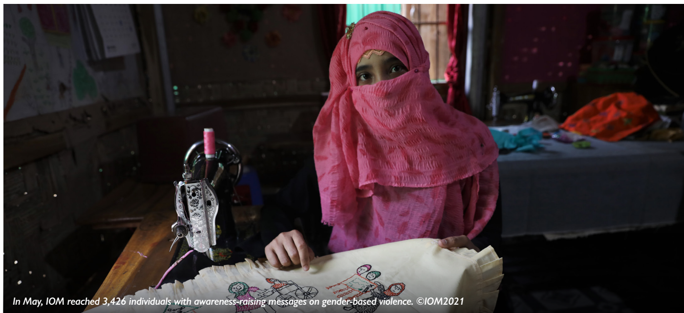
In May, IOM reached 3,426 individuals with awareness-raising messages on gender-based violence.