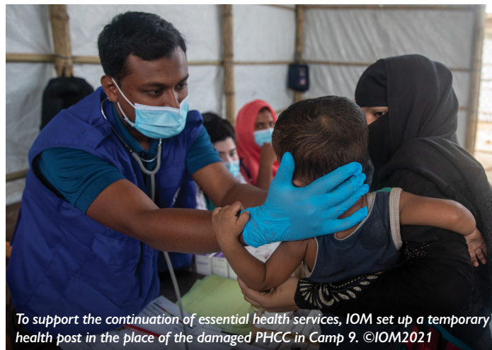
To support the continuation of essential health services, IOM set up a temporary health post in the place of the damaged PHCC in Camp 9.

During the reporting period, DRU transported 60 people (suspected and confirmed COVID-19 cases, deceased and discharged), bringing the total of individuals transported since the beginning of the response to 1,283.