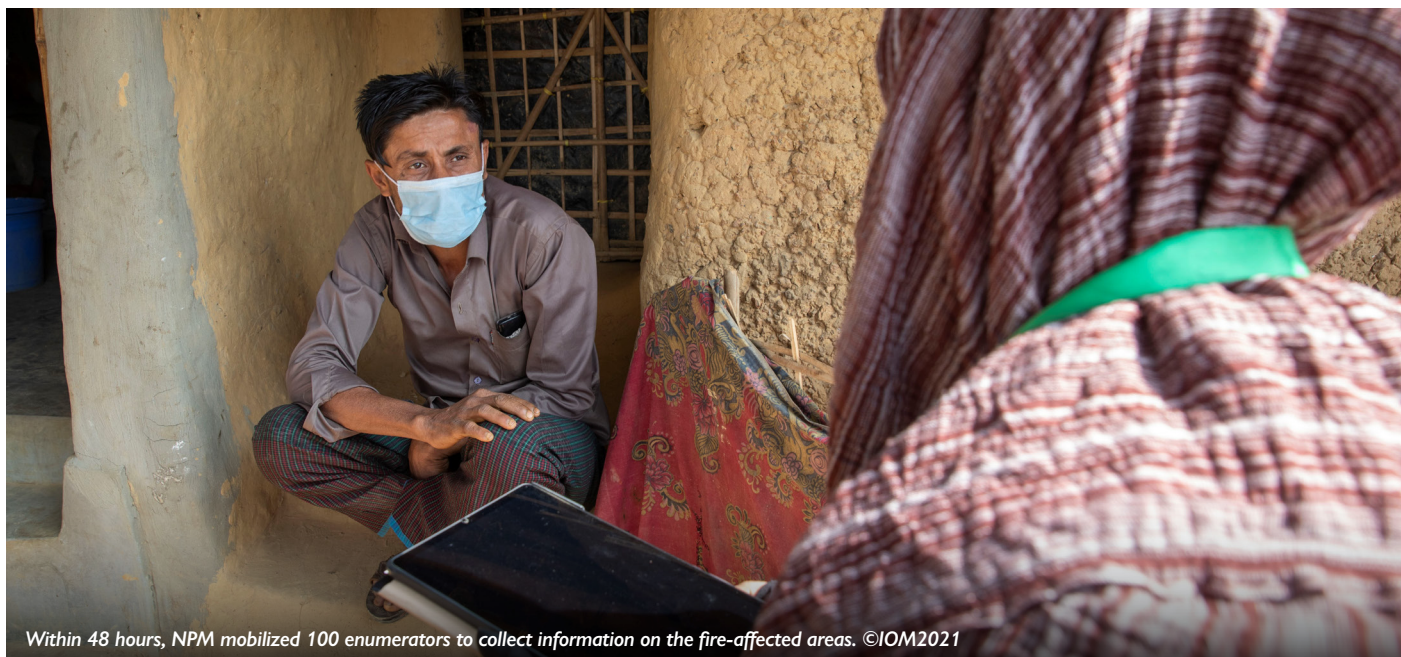
Within 48 hours, NPM mobilized 100 enumerators to collect information on the fire-affected areas.

NPM continues to support the Site Management Sector with the Incident Reporting Mechanism. In February, four incidents were reported. More information on incidents can be found in this dashboard .