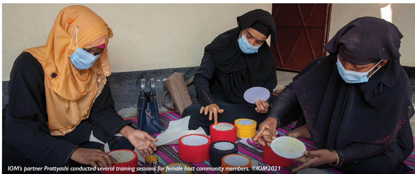
IOM's partner Prottiyashi conducted several training sessions for female host community members.

In response to the fire, IOM's Transition and Recovery Division (TRD) immediately mobilized its resources to assist the host community in close proximity to the fire-affected camps. A door-to-door assessment identified 149 affected households, all of which were promptly provided with emergency shelter and NFI kits. Extending its assistance, TRD teams also distributed 61,700 masks, 2,000 hand sanitizers, 400 goggles, 209 vests, 209 helmets, 209 pairs of gumboots, 1,500 gloves, and four fire extinguishers.