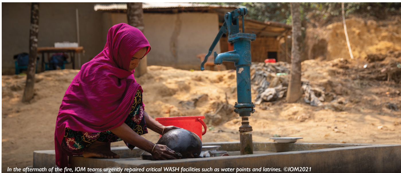
In the aftermath of the fire, IOM teams urgently repaired critical WASH facilities such as water points and latrines.

Responding to the emergency on 22 March in Camp 9, IOM WASH teams quickly assessed the damage caused by the fire to WASH facilities, distributed emergency WASH kits (prepositioned for disaster response), urgently repaired critical WASH facilities such as water points and latrines, and set up emergency water distribution systems through bladders and water trucking.