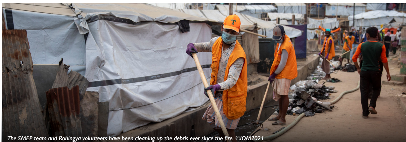
The SMEP team and Rohingya volunteers have been cleaning up the debris ever since the fire.