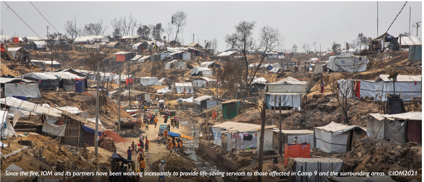
Since the fire, IOM and its partners have been working incessantly to provide life-saving services to those affected in Camp 9 and the surrounding areas.