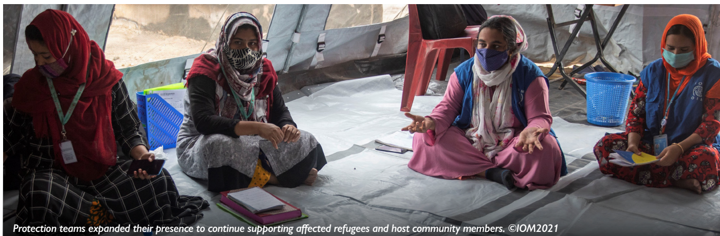
Protection teams expanded their presence to continue supporting affected refugees and host community members.

On the night of 22 March, IOM Protection staff stayed in Camp 18 late into the night, receiving the refugees who fled the fire, giving them water, and helping find them a safe place to stay. In the ensuing days, the teams expanded their presence to continue supporting the refugees and host community members within the fire-affected camps as well as in the camps that received displaced families.