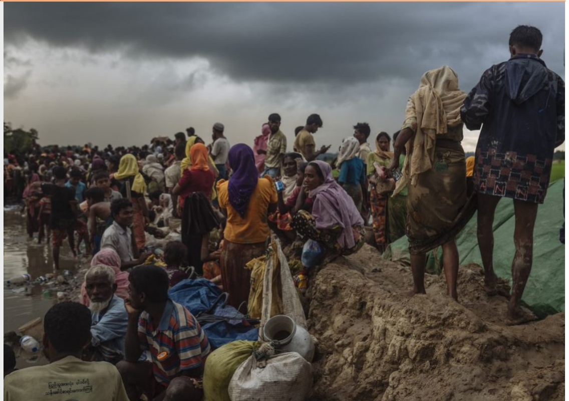
Rohingya families fleeing violence in Myanmar's Rakhine State waiting to cross to Bangladesh. IOM is responding to the needs of the most vulnerable with security, shelter, food, and protection.