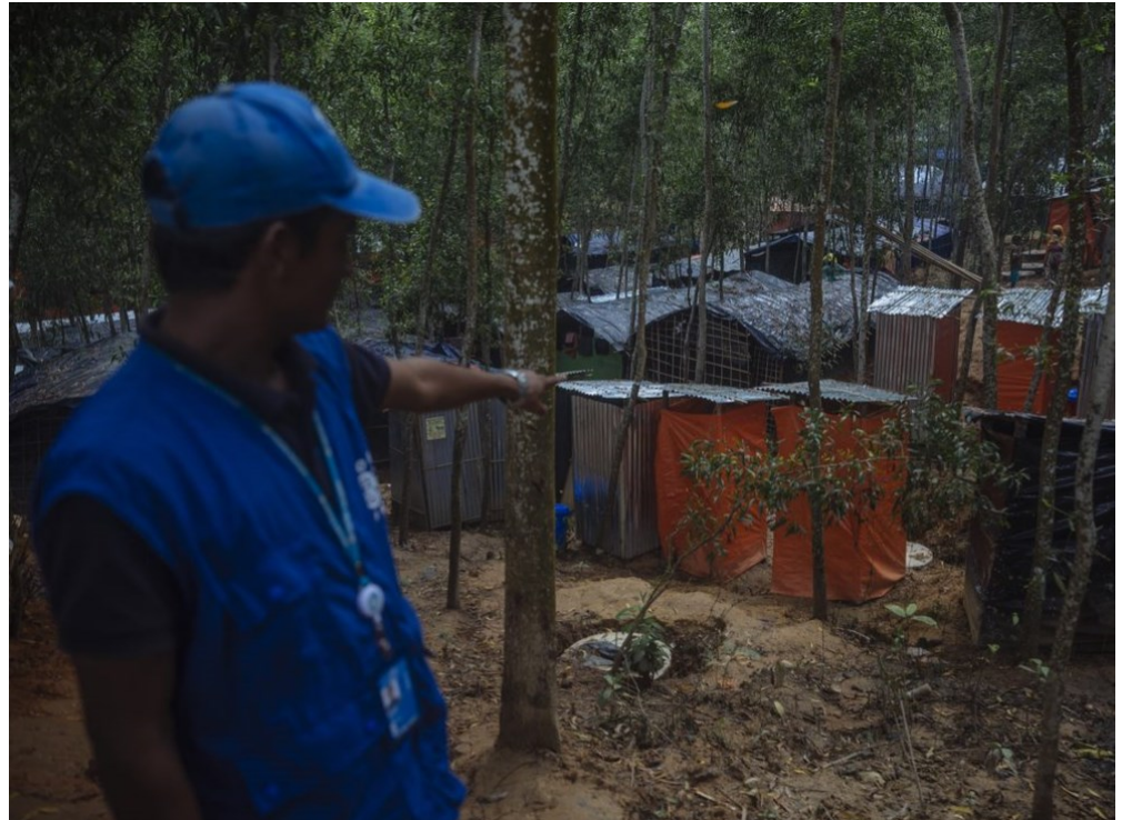
IOM's WASH team surveys emergency pit latrines. WASH services need to be strengthened urgently across all sites.

Water, Hygiene, and sanitation support is critically needed during the response. IOM continues to mobilize resources to support the Rohingya and affected host population receive WASH services. 713,000 litres of safe water has been trucked into spontaneous settlements with limited or no access to water and over 33,000 individuals have benefitted from hygiene kit distributions. 590 emergency pit latrines have been constructed and 89 mobile toilets have been installed to date. Nine deep tube wells have been completed against a target of 35, with more in progress.