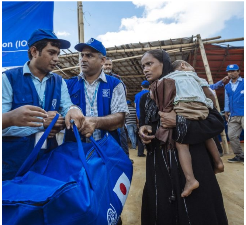
Families receive NFI kit distributions in Kutupalong.

The Government of Bangladesh (GOB) is working closely with IOM and the humanitarian community to meet the needs of the displaced population. As displacement continues, the humanitarian and protection needs of the Rohingya also rise. IOM and the humanitarian community are scaling up operations to respond to the latest displacement.