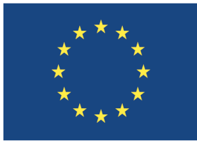
European Union Humanitarian Aid