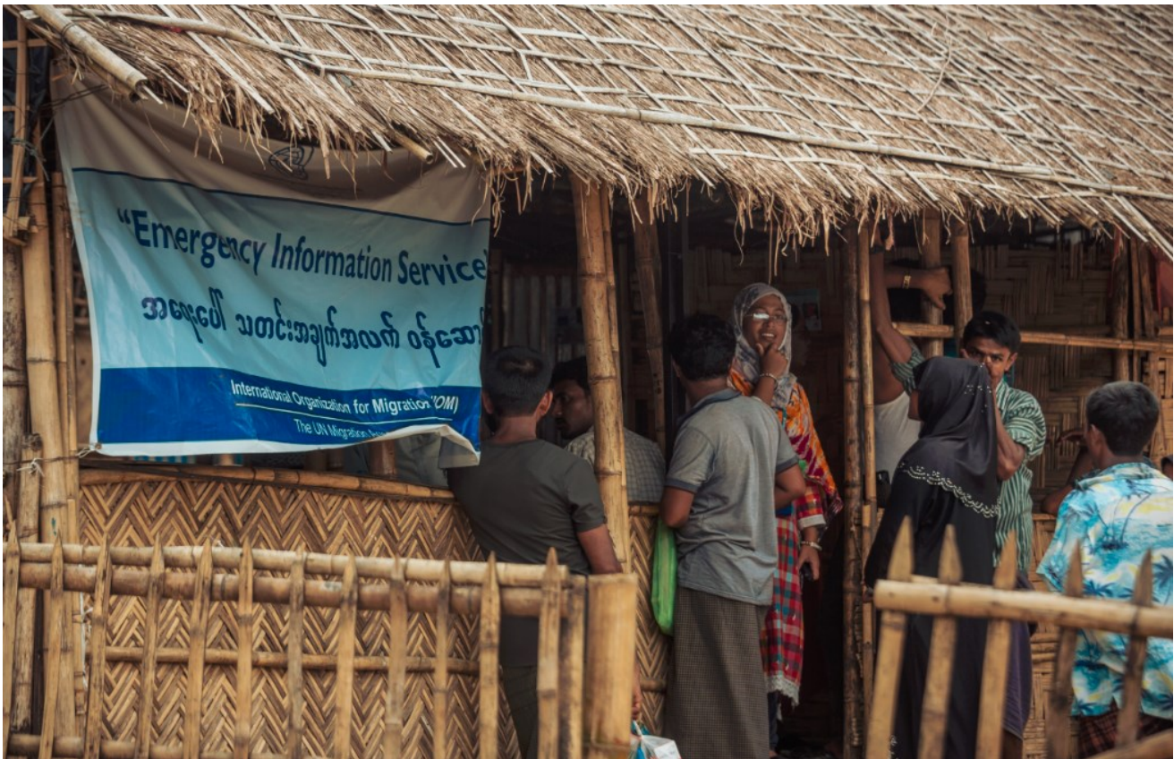
Rohingya refugees wait in line to use the emergency information service which provides details on access to services across sites.

IOM's CwC team is ensuring that Accountability to Affected Populations (AAP) is at the forefront of the response. The team encourages new arrivals to get biometrically registered and ensures they have access to information services. Approximately 100,000 individuals are registered and 500 new arrivals visit information hubs each day. Information Service Centres are currently located in eight locations.