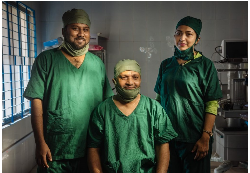
IOM's health team have performed over 500 surgeries at the Ukhiya Health Complex since last year.

IOM works with the Health Sector and the Ministry of Health to establish primary health care services and psychosocial support.