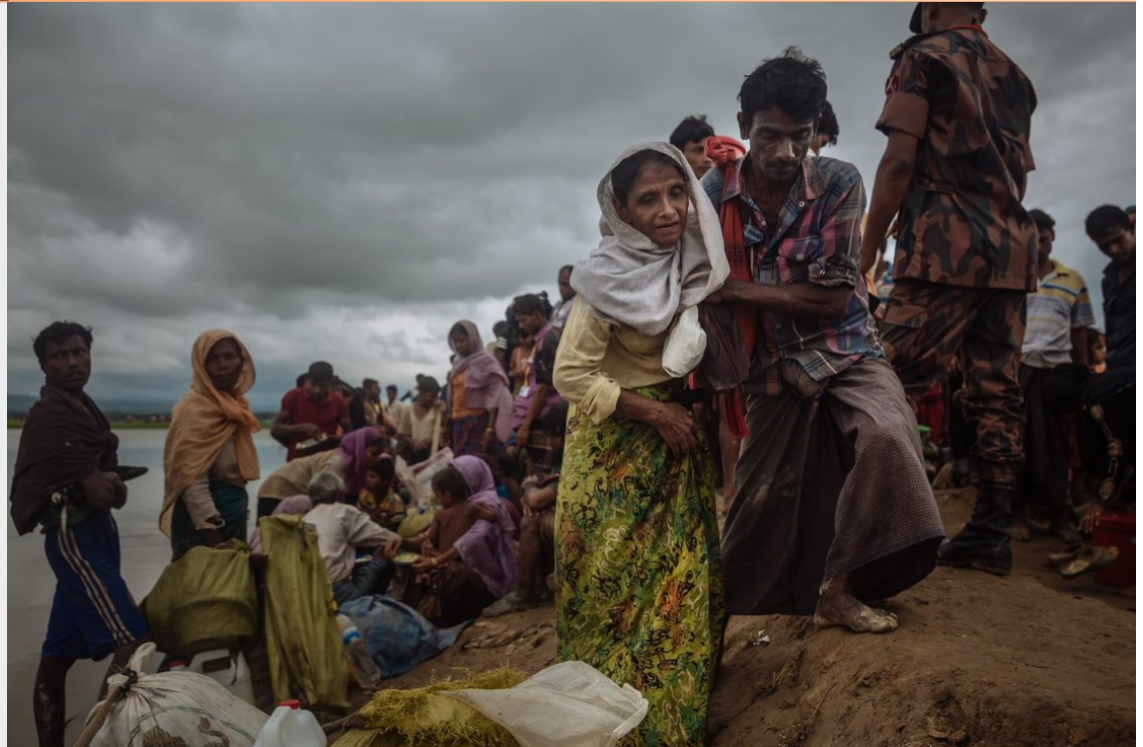
Rohingya families fleeing violence in Myanmar's Rakhine State help each other every step of the way as they cross over to Bangladesh. An estimated 15,000 Rohingya wait to cross at Anjumanpara since 16 October. IOM is responding to the needs of the most vulnerable with security, shelter, food, and protection.