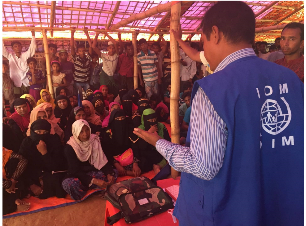
New arrivals in Leda receive a briefing from Site Management on the types of free services available to all.

Water, Hygiene, and sanitation support is critically needed during the response. IOM continues to mobilize resources to support the Rohingya and affected host population receive WASH services. 741,000 litres of water have been trucked into spontaneous settlements with limited access to water. Over 35,000 individuals have received hygiene kit distributions. 660 emergency pit latrines have been constructed and 100 mobile toilets have been installed to date which has supported 33,000 individuals. Twelve deep tube wells have been completed.