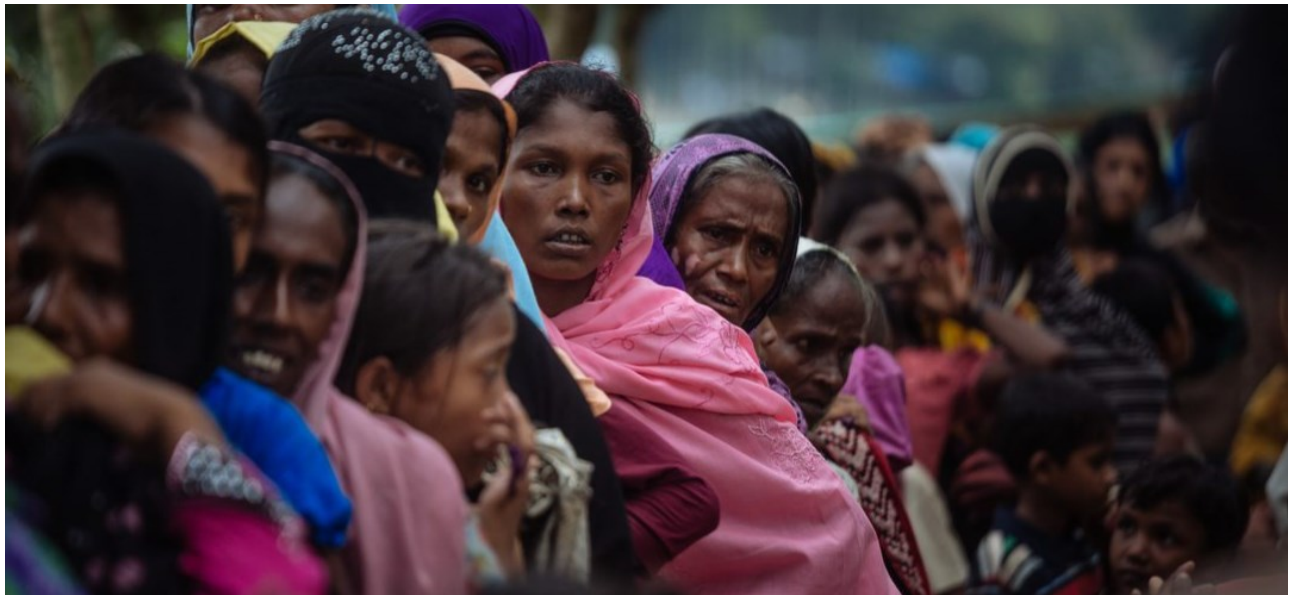
Rohingya women wait in line for shelter kit distributions in Balukhali.

Since 25 August IOM is supporting over 9,000 vulnerable individuals. IOM has also provided over 2,000 people with psychological first aid (PFA). The protection team has referred 1,000 people to health services for specialist care services. Over 2,100 dignity kits and 3,000 solar lanterns have been distributed to vulnerable women, and more will be distributed.