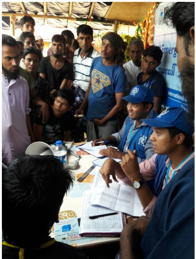
IOM Site Management meet with community leaders in Leda for orientation.