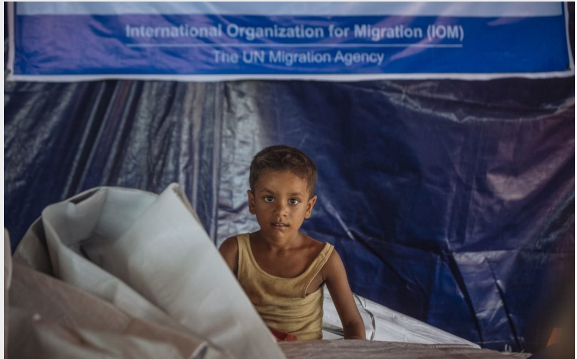
A child attends a shelter distribution in Balukhali. Shelter distributions are ongoing and Rohingya families are given the materials they need to protect them from adverse weather and to give privacy.