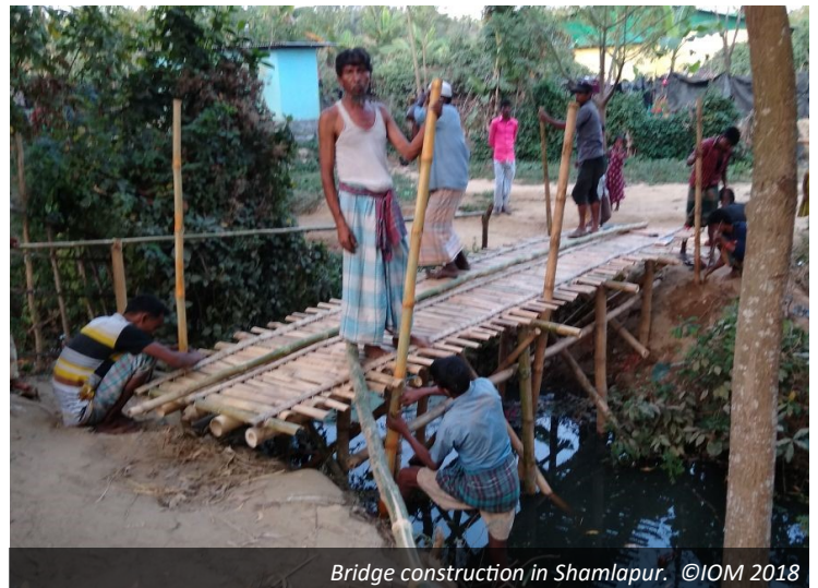
Bridge construction in Shamlapur.

Kutupalong Makeshift Settlement. This week, the works on Pan Bazar Road have consisted of leveling and compaction of the earth. The installation of drainage and shoulder is under way. In addition, 152 Cash for Work laborers (148 male and 4 female) in Camps 9 have been working on the installation of bamboo steps and bridges, fire bucket stands, and drainage.