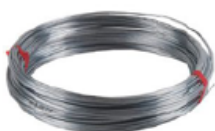
Tie Wire (Ø1.5mm)