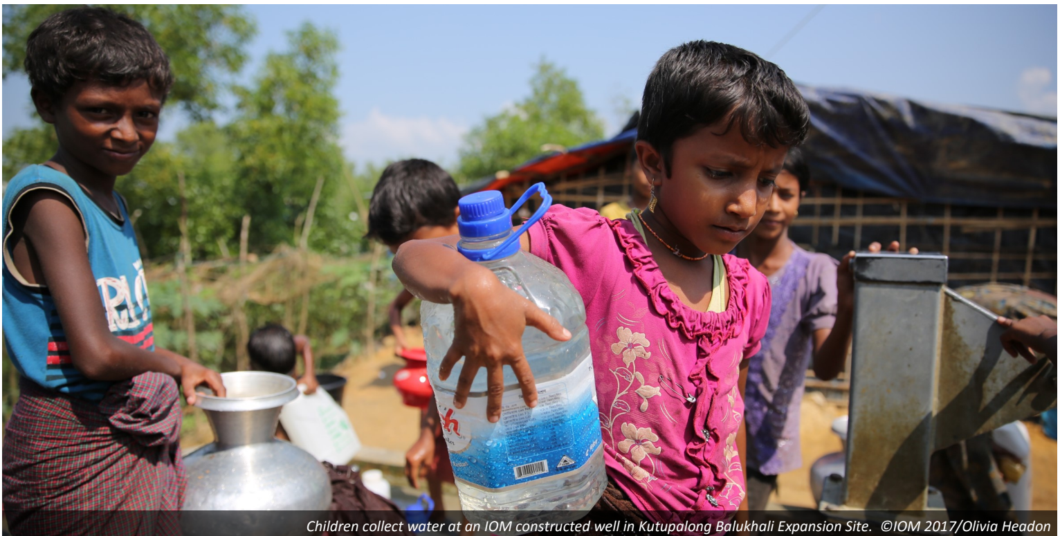
Children collect water at an IOM constructed well in Kutupalong Balukhali Expansion Site.

To enhance good hygiene practices, a soap distribution plan for Shamlapur will be prepared. For each household, 7 laundry and 7 bathing soaps will be distributed which should be sufficient for a full month. Since January, 69,538 soaps have been distributed to 4,967 households in Zones LL and XX (camps 9 and 18).