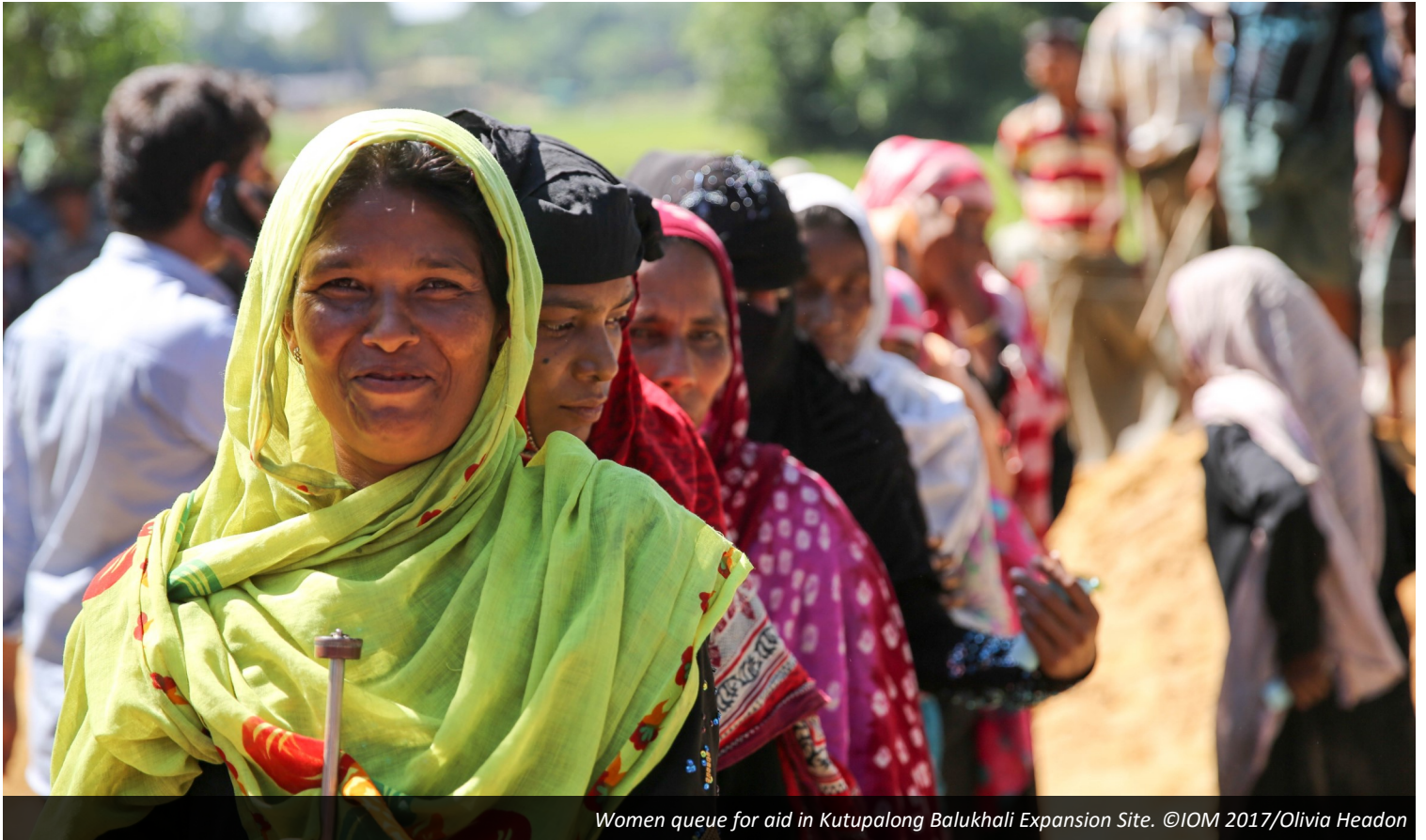
Women queue for aid in Kutupalong Balukhali Expansion Site.