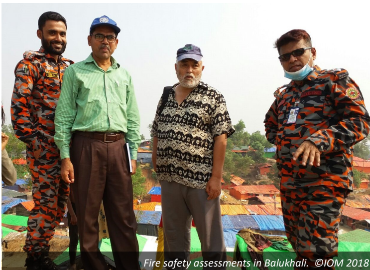
Fire safety assessments in Balukhali.

Additionally, road construction works are being delayed due to some families unwilling to relocate to other areas.