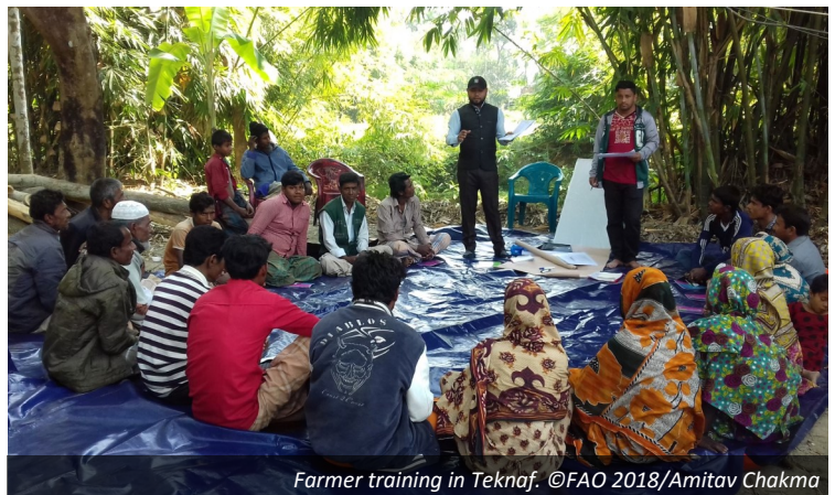
Farmer training in Teknaf.

receive 72 mini-tillers, 72 high-efficiency irrigation pumps, and government-provided inputs (e.g. seeds, fertilizers).