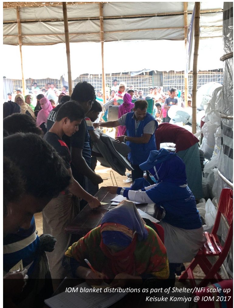
IOM blanket distributions as part of Shelter/NFI scale up

To date, IOM has distributed 124,000 tarpaulins , benefitting 564,000 new arrivals. Additionally, 360,000 individuals have benefitted from NFI distributions. IOM is procuring items for a common pipeline, which will be open for all shelter sector partners.