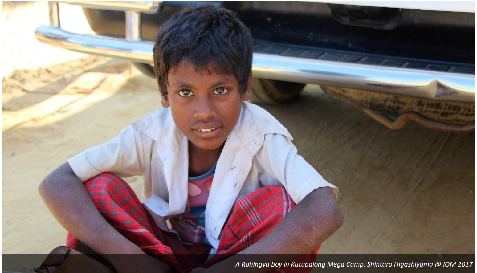
A Rohingya boy in Kutupalong Mega Camp.