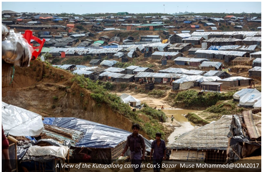
A View of the Kutupalong camp in Cox's Bazar