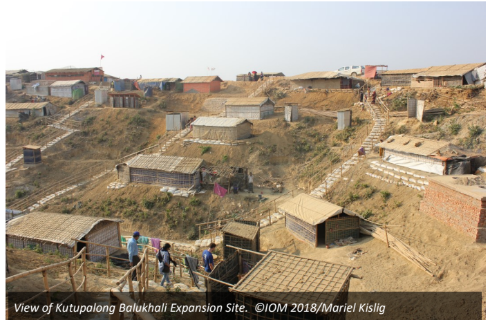
View of Kutupalong Balukhali Expansion Site.

community . IOM and its partners continue to scale up operations to respond to the needs of new arrivals, existing Rohingya, and affected host communities.