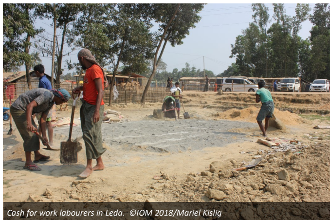
Cash for work labourers in Leda.

IOM has established Safety and Security Committees and has trained the members to build the capacity of the community to respond to emergencies . An initial list of 75 members of the committee in Camp 10 has been prepared, including 23 women volunteers. The 50-member final committee will be formed through a short interview with the members. Additionally, three committees were formed and trained in Leda and six in Uchiprang.