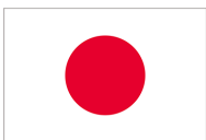
From the People of Japan