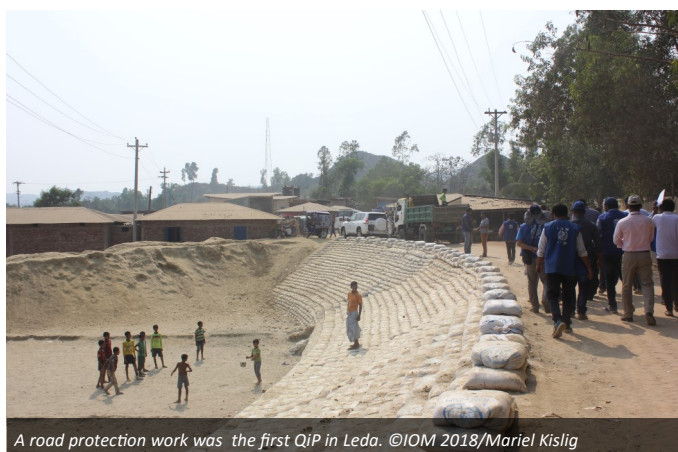
A road protection work was the first QiP in Leda.

In Leda, Uchiprang and Shamlapur, the Para Development Committees (PDC) continue to be engaged in mobilizing manpower from host communities and refugees to participate in Quick Impact Projects (QiPs) as cash for work labourers .