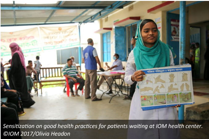
Sensitization on good health practices for patients waiting at IOM health center.

This week, 11,543 consultations occurred , bringing the