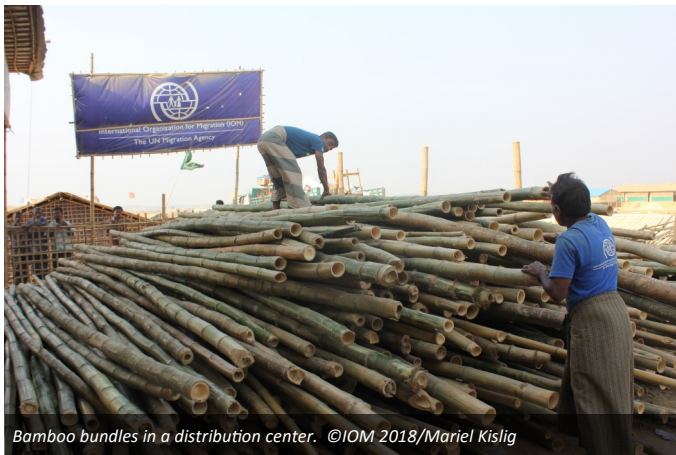
Bamboo bundles in a distribution center.

Finally, IOM conducted a consultation with the community on the upcoming shelter upgrade and relocation plan in Unchiprang. The main concern raised during the discussion was that the shelter kit was insufficient for large families . IOM will run another round of meetings with the community and is planning to design a shelter for larger families.