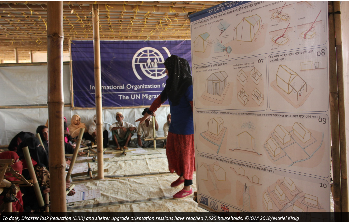
To date, Disaster Risk Reduction (DRR) and shelter upgrade orientation sessions have reached 7,525 households.