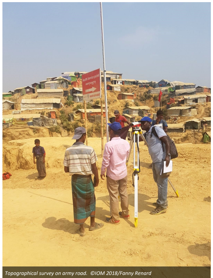
Topographical survey on army road.

Regarding Site Development activities, IOM has worked this week on the construction of shelter plots to