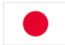
From the People of Japan