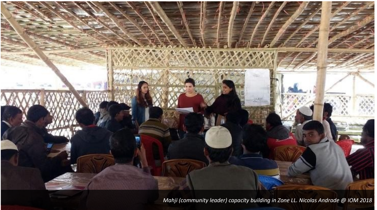
Mahji (community leader) capacity building in Zone LL.

In the past week, IOM responded to 129 Protection/GBV cases. Overall, IOM has identified 15,126 extremely vulnerable individuals and 432 GBV cases have been assisted through IOM's case management. Additionally, 4,077 individuals have received psychological first-aid and 24 Victims of Trafficking (VOTs) have been identified and assisted.