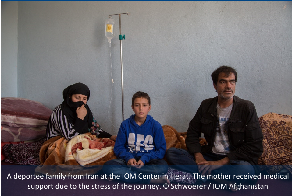
A deportee family from Iran at the IOM Center in Herat. The mother received medical support due to the stress of the journey.