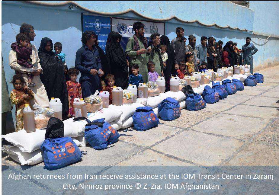
Afghan returnees from Iran receive assistance at the IOM Transit Center in Zaranj City, Nimroz province