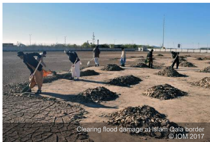
Clearing flood damage at Islam Qala border

A total of 9,351 undocumented Afghans spontaneously returned or were deported from Iran from 2-8 April, all of them through Milak border in Nimroz province. Islam Qala border remains closed for undocumented returns due to recent flooding. Out of the total spontaneous returnees, 264 (8%) were in family groups and 3,244 (92%) were individuals. Similarly, out of the total deportees, 519 (9%) were in family groups whereas 5,288 (91%) were individuals. This brings the total number of undocumented returnees from Iran since 1 January 2017 to 74,992 . IOM provided post-arrival humanitarian assistance to 404 (2%) undocumented Afghans deported from Iran at its Transit Center in Nimroz, including 38 unaccompanied migrant children, 25 medical cases, 24 special cases, 7 single parents and 6 unaccompanied elderly.