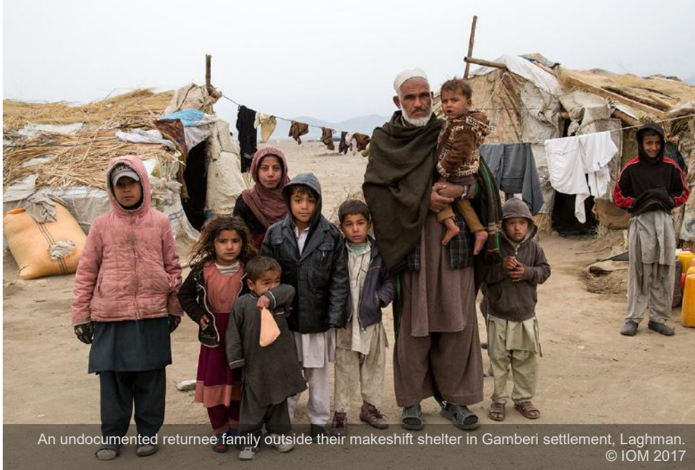
An undocumented returnee family outside their makeshift shelter in Gamberi settlement, Laghman.