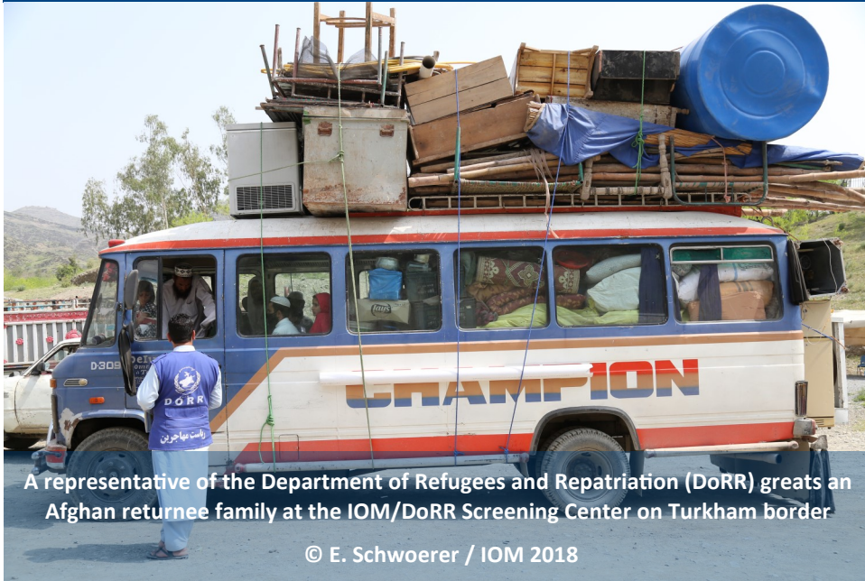
A representative of the Department of Refugees and Repatriation (DoRR) greets an Afghan returnee family at the IOM/DoRR Screening Center on Turkham border