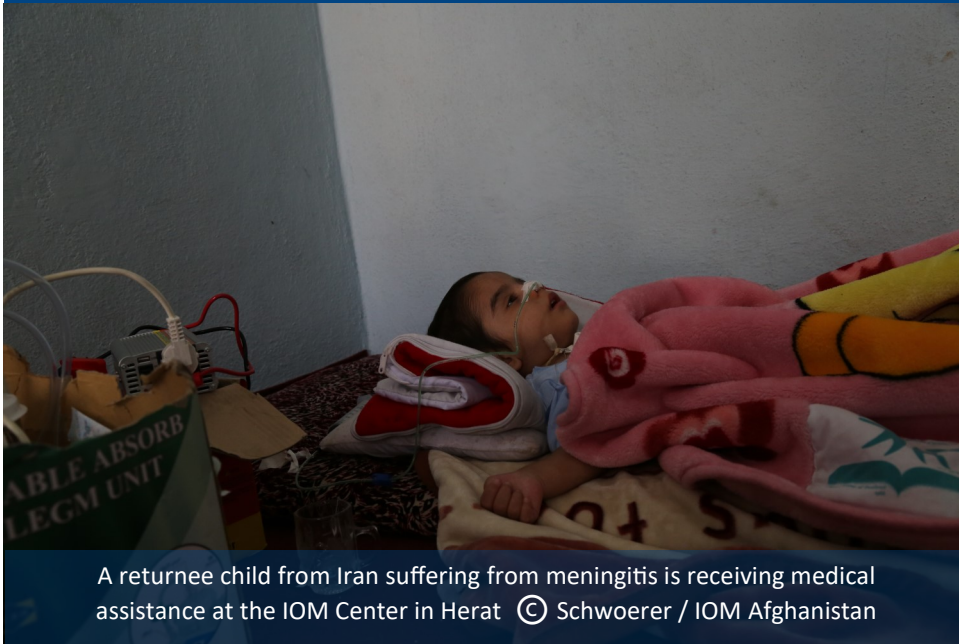
A returnee child from Iran suffering from meningitis is receiving medical assistance at the IOM Center in Herat